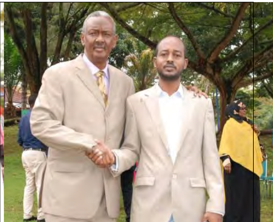
Senator Ahmed Hashi Mohamud, Federal Parliament of Somalia attend leadership training on gender equality.