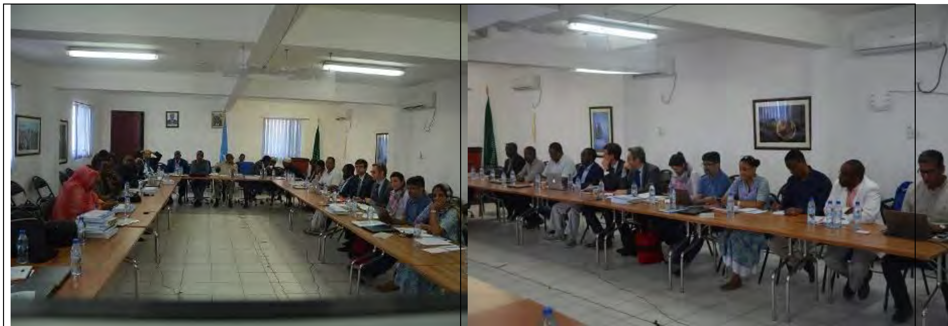
Project Board Meeting for Parliament Support Project, Mogadishu, Somalia.