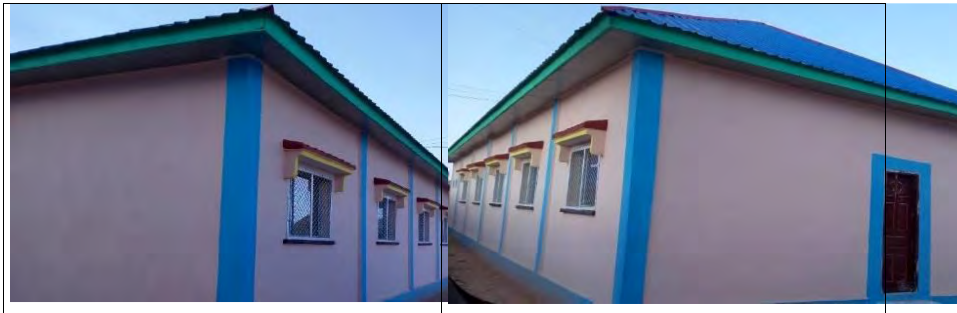
Construction of Secretariat Building for Galmudug State Assembly, in Adado Somalia.