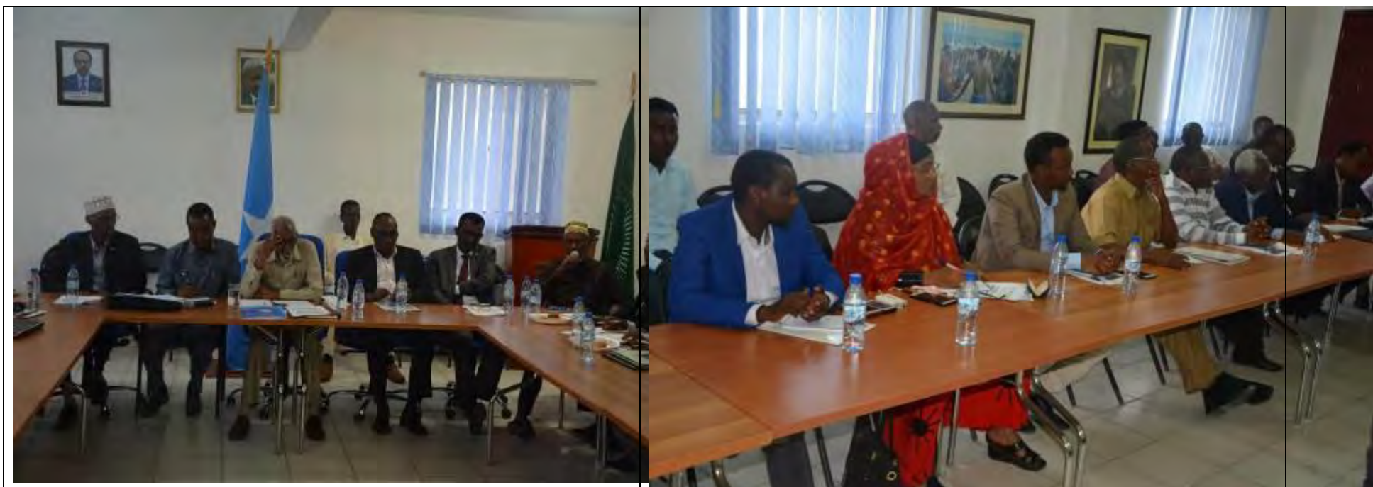
Consultative Meeting of Somali Federal & State Parliaments -Mogadishu, Somalia.