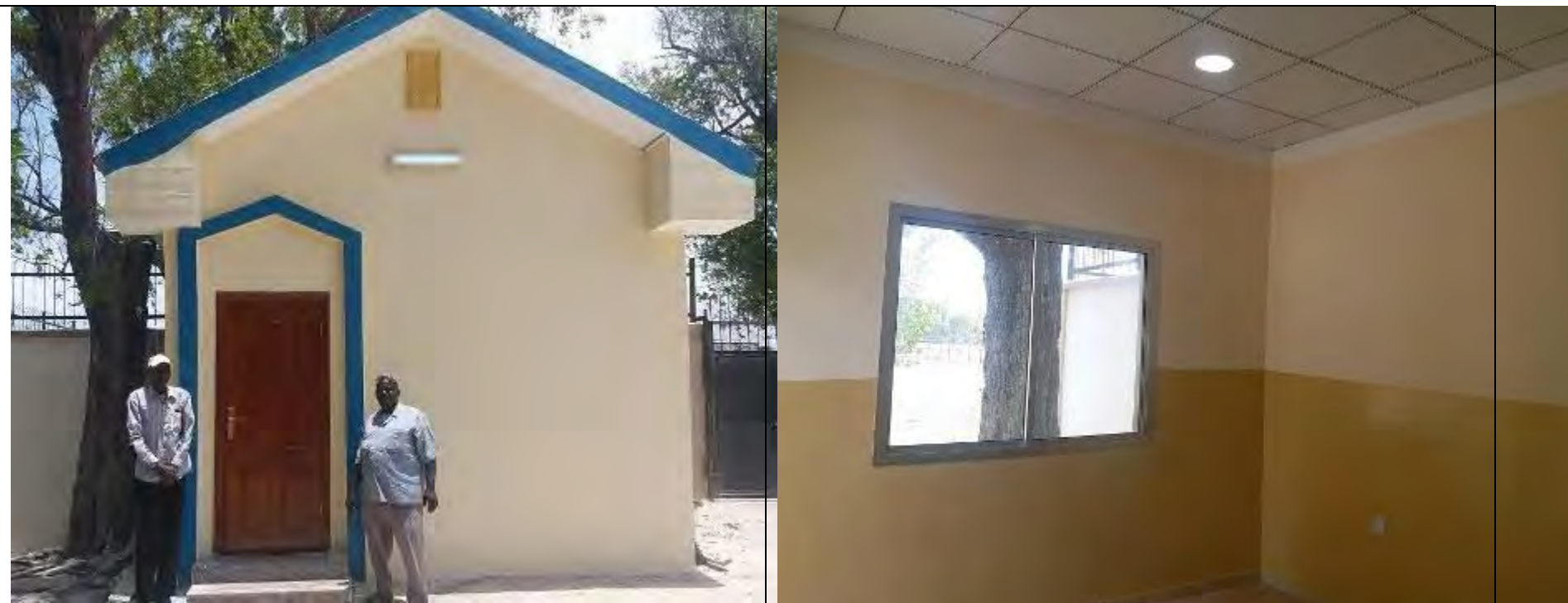
Construction of Security Screening Room for National Federal Parliament (Upper House), in Mogadishu, Somalia.