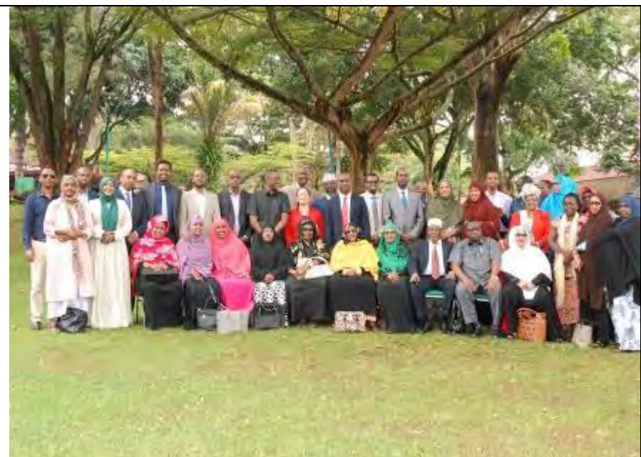
Somalia MPs and Senators from both Federal and State parliaments attend Transformative Leadership for Results training in Entebbe, Uganda