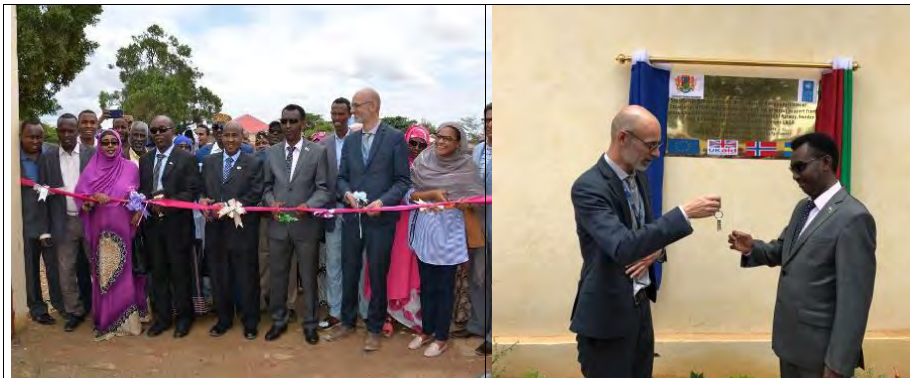
Handover Ceremony of South West State Assembly Secretariat Office, Somalia.