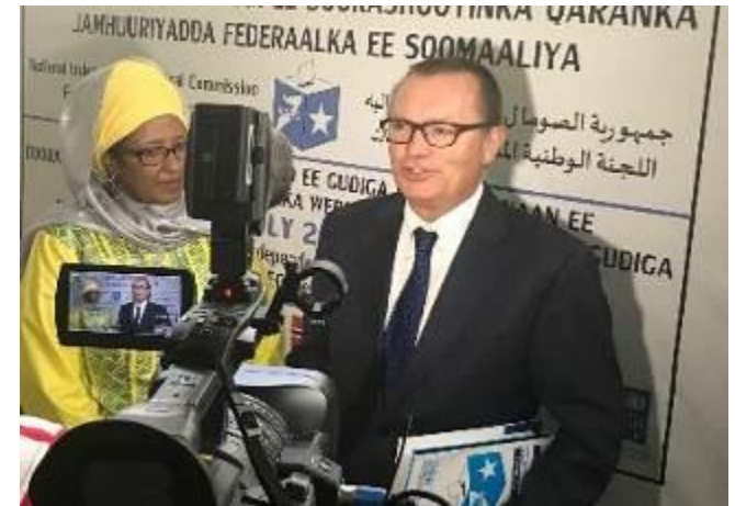
Figure 7-8. Under-Secretary-General (USG) Feltman meeting NIEC Commissioners, underscoring international support to universal elections (27 August 2017, Mog)