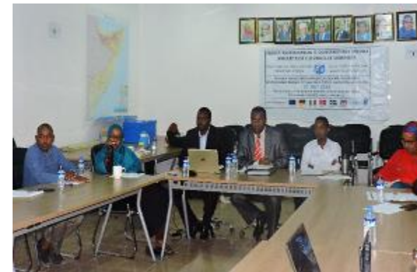
Figure 4: NIEC brochure (supported by JP Electoral Support). Figure 5: NIEC accredited associate membership of A-WEB (31 Aug 2017, Bucharest). Figure 6: NIEC training on political party registration (9 August 2017, Mogadishu)