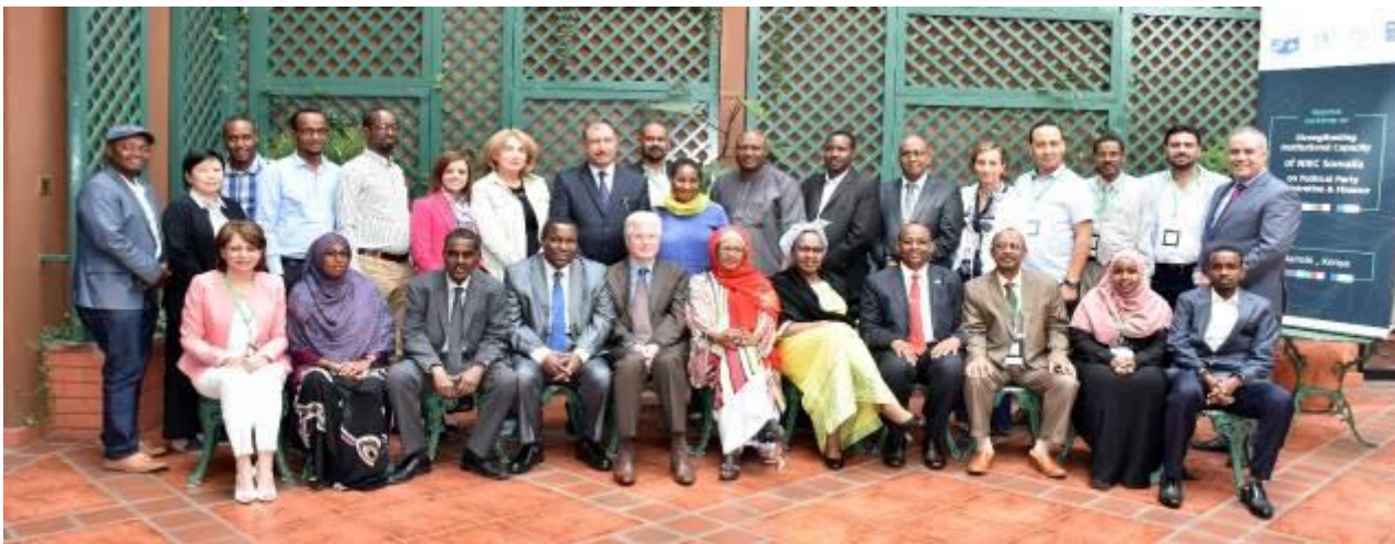
Figure 9: NIEC workshop on political party registration with representatives of other African and Arab EMBs. (12 July 2017, Nairobi).