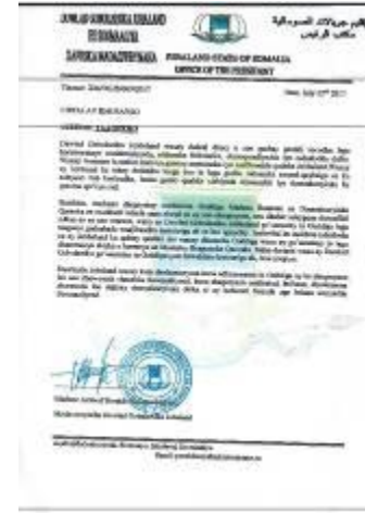
Figure 1: NIEC banner with donor logos. Figure 2: NIEC training on polling procedures (24 July 2017, Mogadishu) Figure 3: Jubaland President letter supporting NIEC in its mandate (22 July 2017)