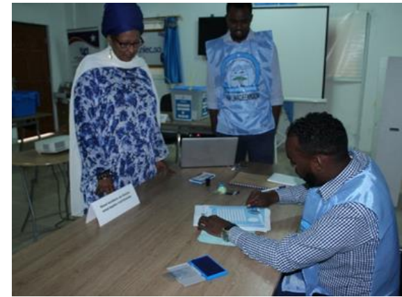
Figure 1: NIEC banner with donor logos Figure 2: NIEC Procurement and Management Training (15 June) Figure 3: NIEC Polling and Counting simulation exercise (19 June)