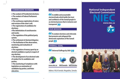
Figure 4: NIEC brochure (supported by JP)