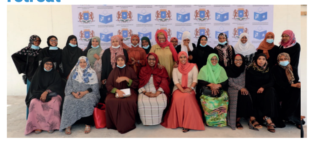
From 24 to 26 January, the NIEC, supported by IESG, held an all-staff retreat to reflect on its performance since it was established in 2015. The objective was to look back at achievements and identify areas for improvement.

The outcome of the retreat will help the NIEC to enhance its institutional capacity and develop a five-year strategic plan (2022-2026), as it prepares to conduct universal elections in 2024/25.