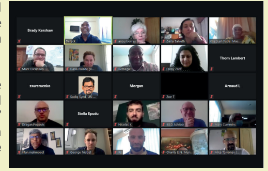
Screenshot of participants in the ETF meeting on 26 January 2021

The ETF, chaired by IESG, will meet weekly to share information, analyze and address challenges, and formulate recommendations to the UN senior leadership. IESG will compile a 'UN Weekly Electoral Update' document for internal UN circulation, to provide a summary of main electoral events, as well as an overview of the UN system-wide preparatory and support activities to the electoral process.