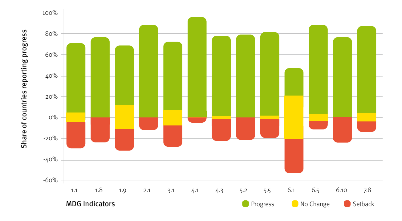
Figure 1 : Proportion of countries progressing or regressing on MDGs (low- and middle-income countries)