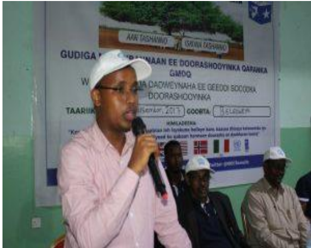
Figure 3: NIEC consultation sessions with political and religious leaders, youth and traditional leaders in Beledwene, Hudur and Hirshabele between 23 December and 1 January 2018