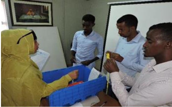
Figure 10: NIEC workshop on political party registration with representatives of African and Arab EMBs. Nairobi, 10-12 July 2017.