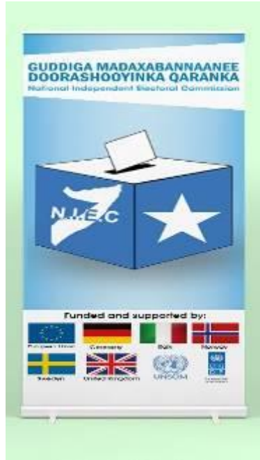
Figure 1: NIEC banner with donor logos and a woman voting