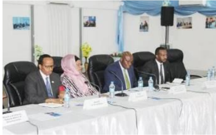
Figure 5: NIEC accredited associate membership of A-WEB (31 Aug 2017, Bucharest), Photo credit UNSOM.