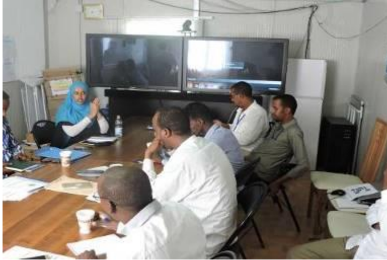
Figure 2: NIEC Operations Management Strengthening and Support workshop organized by IESG in May 2017