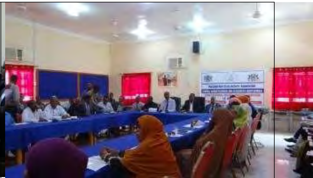
MoCA meeting with CSOs in Adado