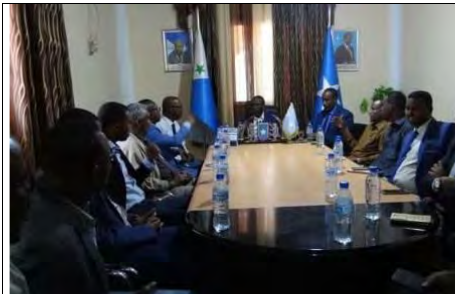
MoCA meeting with Galmudug President in Adado