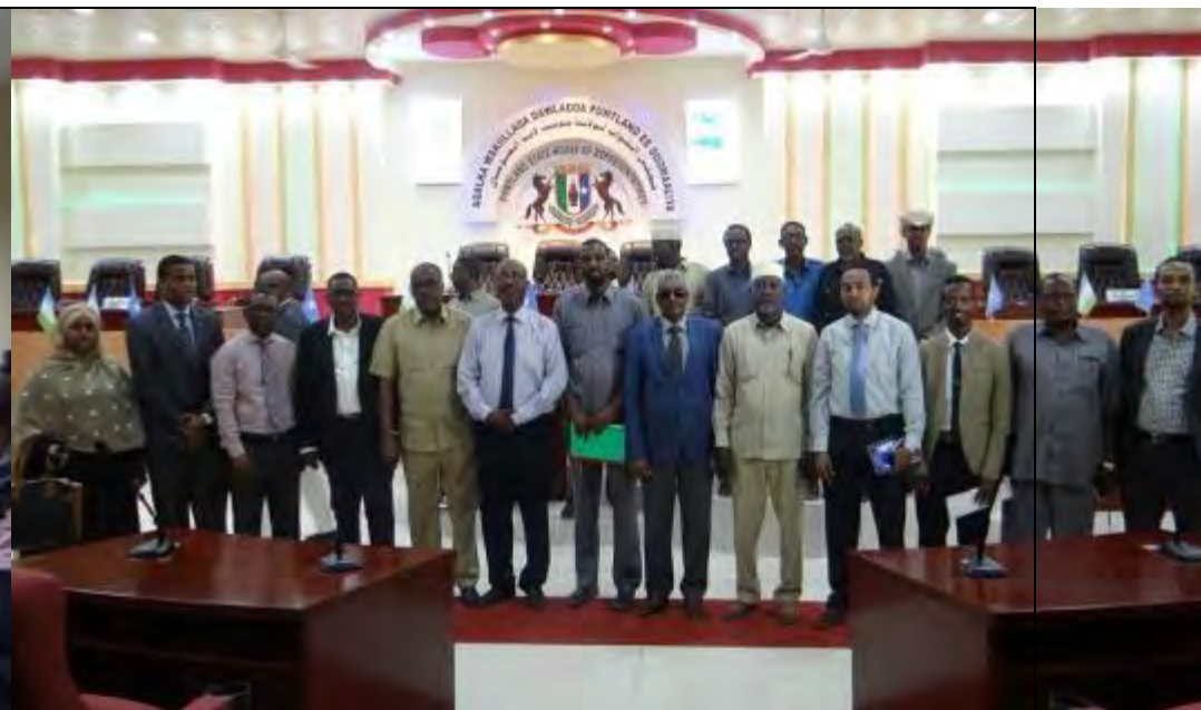
MoCA meeting with Puntland MPs in Garowe.