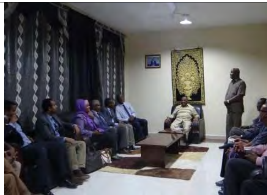
Federal MoCA meeting with Puntland President in Garowe