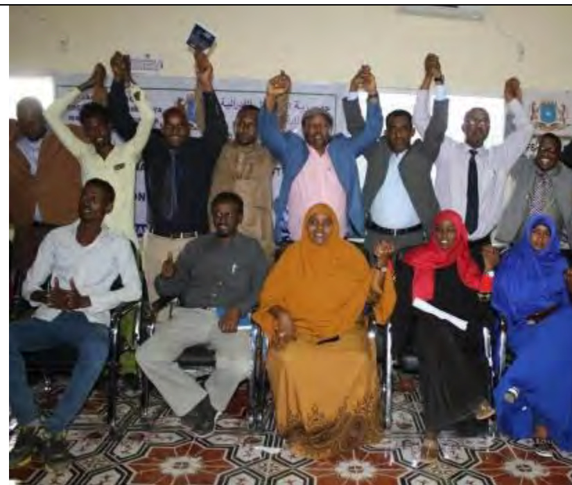
MoCA meeting South West MPs in Baioda