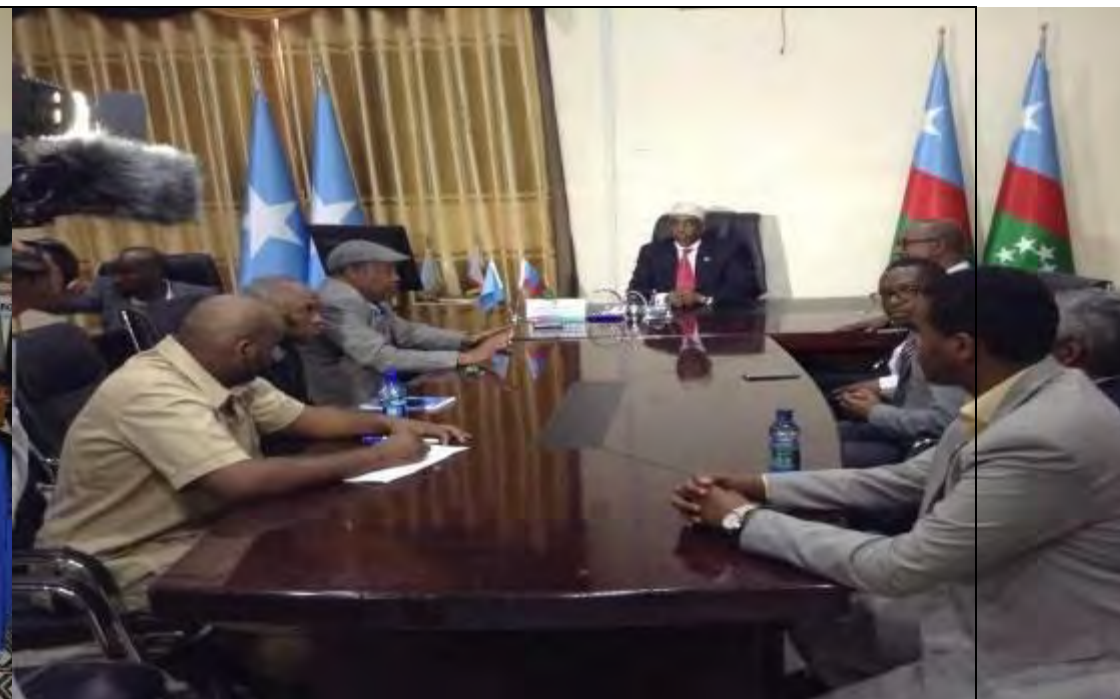
MoCA meeting with South West State President