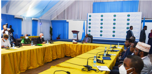
International partners meeting with the NCC on 4 January 2022.

The National Consultative Council (NCC) concluded its seven-day meeting in Mogadishu which started on 3 January. During its meetings, the NCC met with the Council of Presidential Candidates (CPC), civil society and the international community representatives. This NCC meeting focused on improving the electoral integrity, completing the House of the People (HoP) elections, enhancing electoral security and managing the drought. On 9 January, the NCC published an 18-point communique stipulating that the ongoing HoP elections will be concluded between 15 January and 25 February 2022.