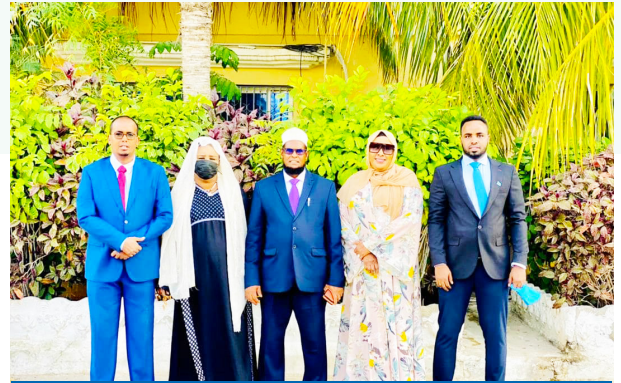
EDRC chairperson (centre) on 22 January.

On 22 December, EDRC rejected and did not accept or register the complaint of two out of the three candidates competing for seat HoP 225 allocated to Somaliland as unsubstantiated. The two candidates claimed that the process of the indirect election of the seat on 19 December was not in accordance with the election procedures and code of conduct.