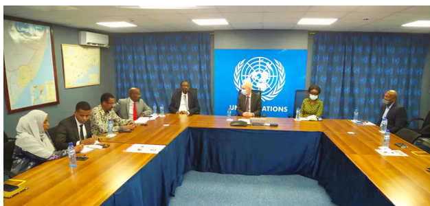
SRSG meeting with the new FEIT chairperson and international partners on 25 January.

February and then undertake elections in the second locations for the remaining seats.