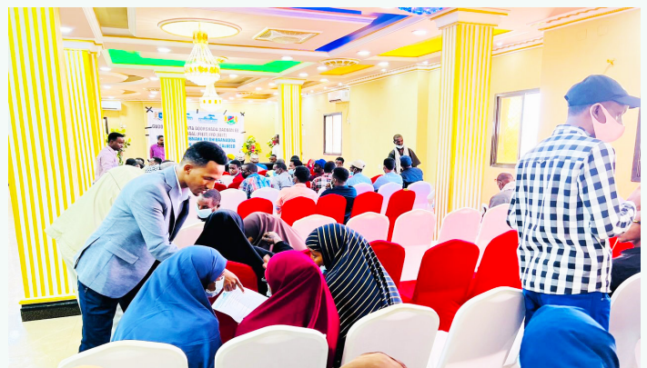
Delegate training on 16 January in Baidoa.

The FEIT member responsible for international stakeholder engagement met with the IESG External Relations Advisor on 6 December and discussed FEIT plans to hold thematic information meetings regularly for the remaining electoral period with the various partners including donors, national and international stakeholders, and ambassadors of various countries. The FEIT member noted the first thematic meeting would be on the 30% women's quota.