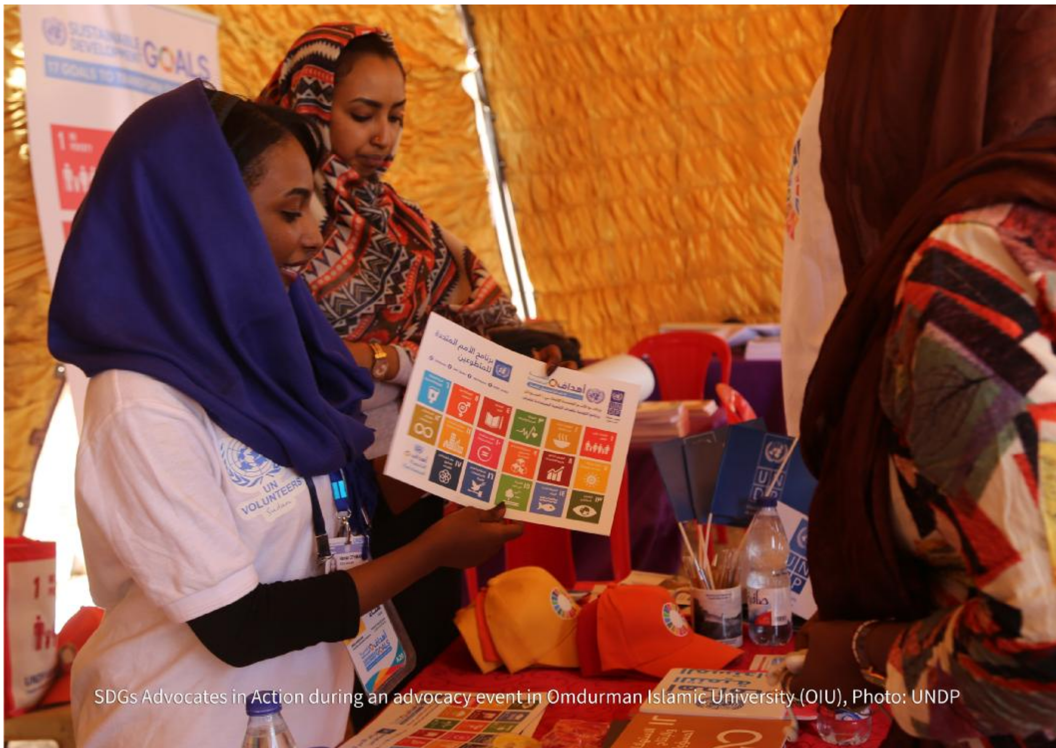
SDGs Advocates in Action during an advocacy event in Omdurman Islamic University (OIU)