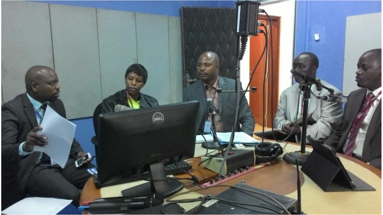
“Members of the Panel at the National Radio Studio”, 19 th Oct. 2014