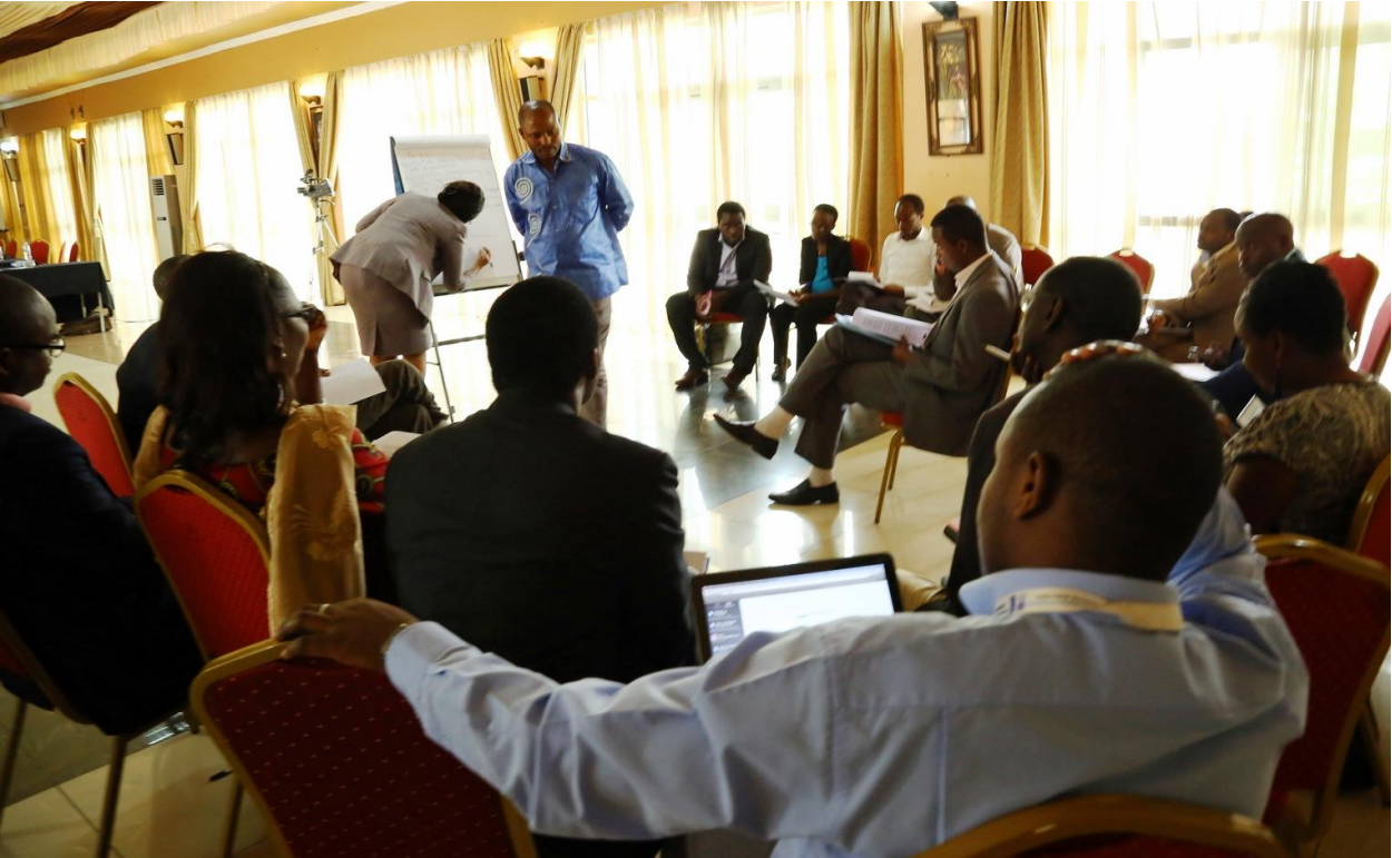
“Consultations and Participation in another break-away Group”, 24 th September 2014