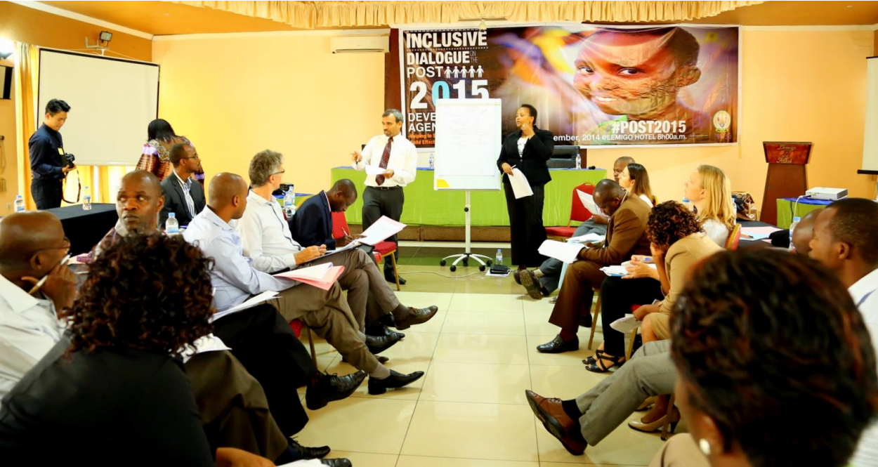
“Consultations and Participation in one of the break-away Groups”, 24 th September 2014