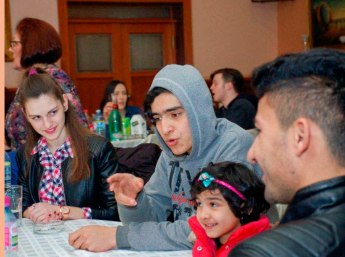
Locals and migrants share Serbian and Middle-East specific food at the same table in Subotica, thanks to the Center for Youth Work CSO

Left: Flash mob exhibition of personal stories of migrants