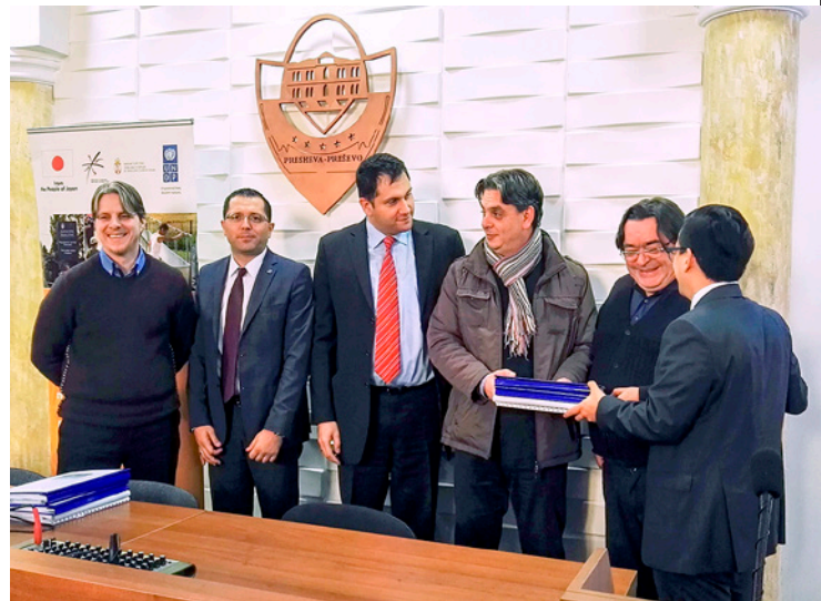
The handover of the General Water Supply Design, prepared to ensure long-term improvements in the supply of water in Preševo