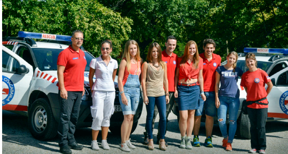
Training of women rescuers