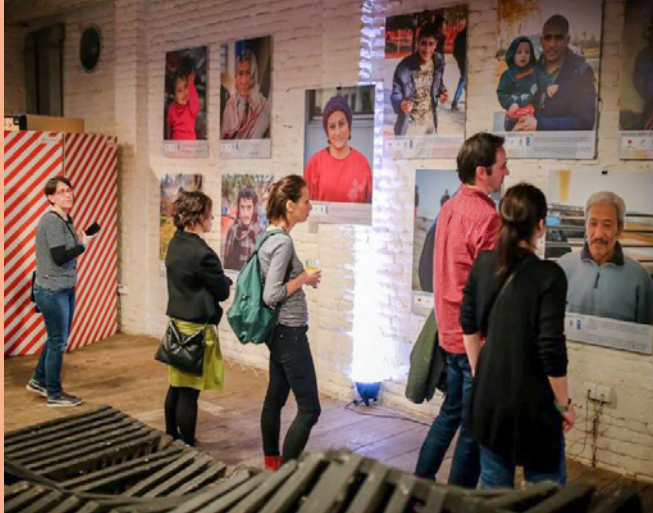
“You Will Never Walk Alone” Exhibition of individual migrant stories in Subotica

Left: Flash mob exhibition of personal stories of migrants