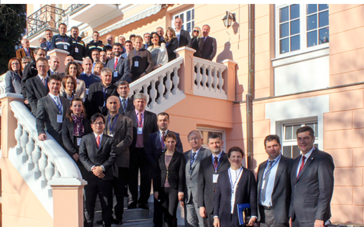
Training of local Emergency HQs from Kraljevo, Vrnjačka Banja, Čačak and Kragujevac, in cooperation with the National Training Center