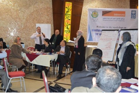
Part of the discussion during the workshop

In addition, the programme held a workshop to identify the selection criteria for students' enrollment. The workshop was attended by local