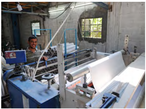
UNDP signs agreement with the Union of Palestinian Industries for empowering youth in Gaza