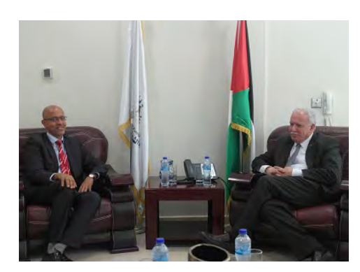
UNDP Special Representative pays courtesy visit to Minister of Foreign Affairs. Read More