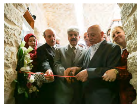
Al Quds University Public Library Opens its Doors in Jerusalem with Funds from Bahrain through UNDP. Read More