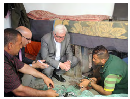
German Foreign Minister visits fishermen project in Gaza. Read More