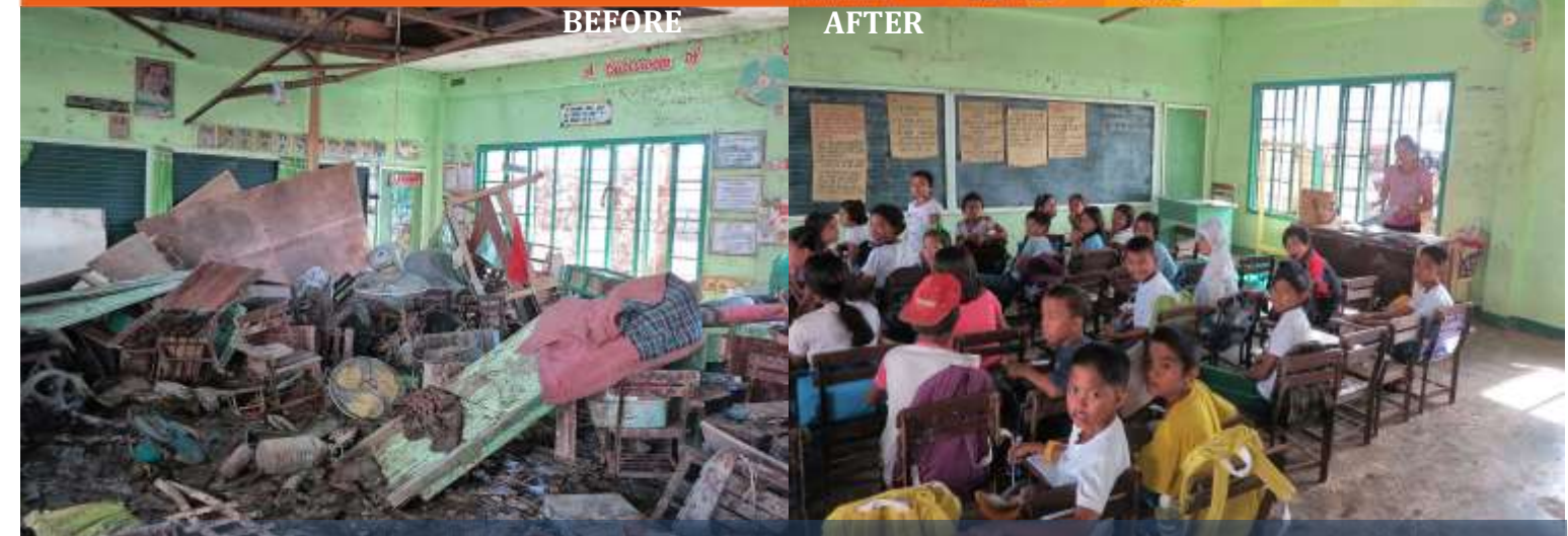
Typhoon Haiyan (Yolanda) made landfall on 8 November causing tremendous destruction and loss of life. Three months later, these children at Fisherman's Village were able to return to school after an intense UNDP clean-up effort.