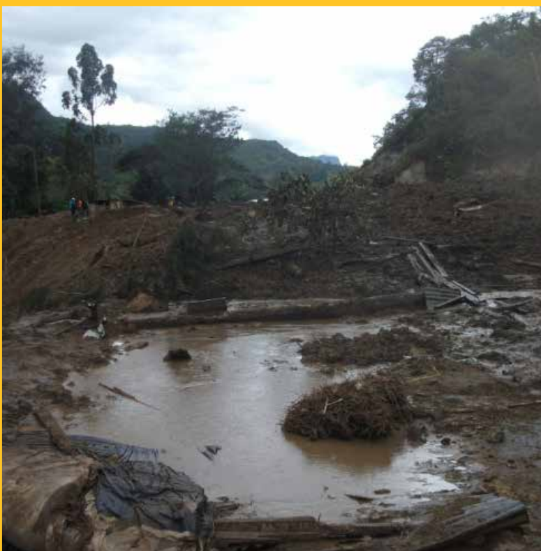
Aftermath of the landslide in Kenagi village, Eastern Highlands Province