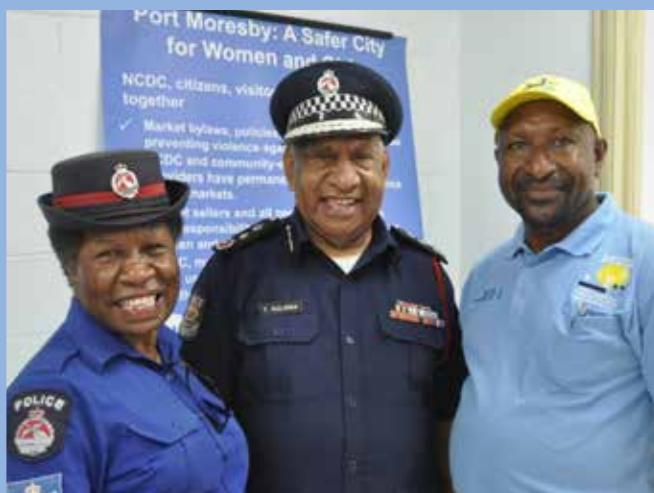
Gordons Market Police Unit Officer in Charge, Royal Papua New Guinea Constabulary Commissioner, and NCDC Market Management Division – Supervisor for Planning and Safe City Programme team member, Port Moresby

Since it began, the programme, in partnership with the National Capital District Commission, has made conspicuous impacts in Gerehu market in Port Moresby.