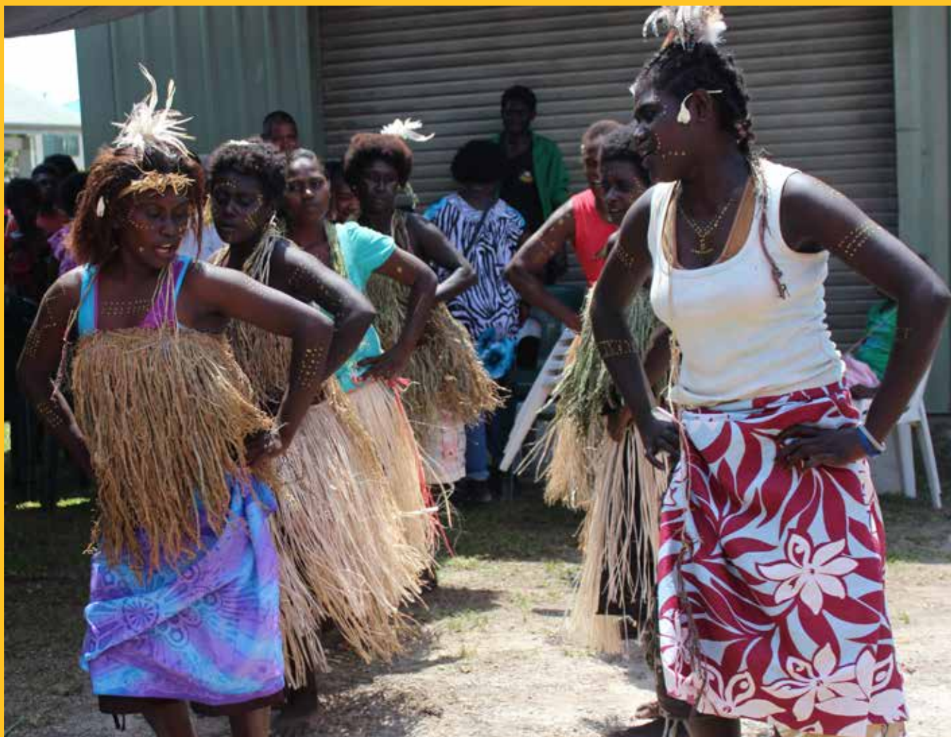
Celebration to launch the Family Support Centre in Buka, Autonomous Region of Bougainville

In 2014 the UN will continue to support national efforts to improve children and women's access to comprehensive services for survivors of violence.