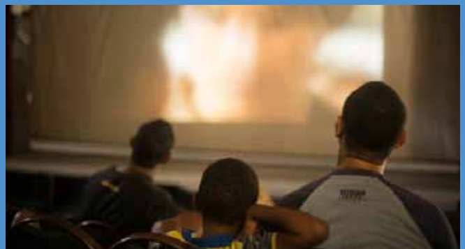
Audience members at the Human Rights Film Festival, Port Moresby

The organizing committee of the Human Rights Film Festival is led by the UN and comprises members and sponsors from the Government of Papua New Guinea, several UN agencies, development partners, NGOs, and the private sector. With 2014 bringing the 5th anniversary of the Human Rights Festival, this year's event aims to reach even more people, facilitating discussion and education about key human rights topics across PNG.