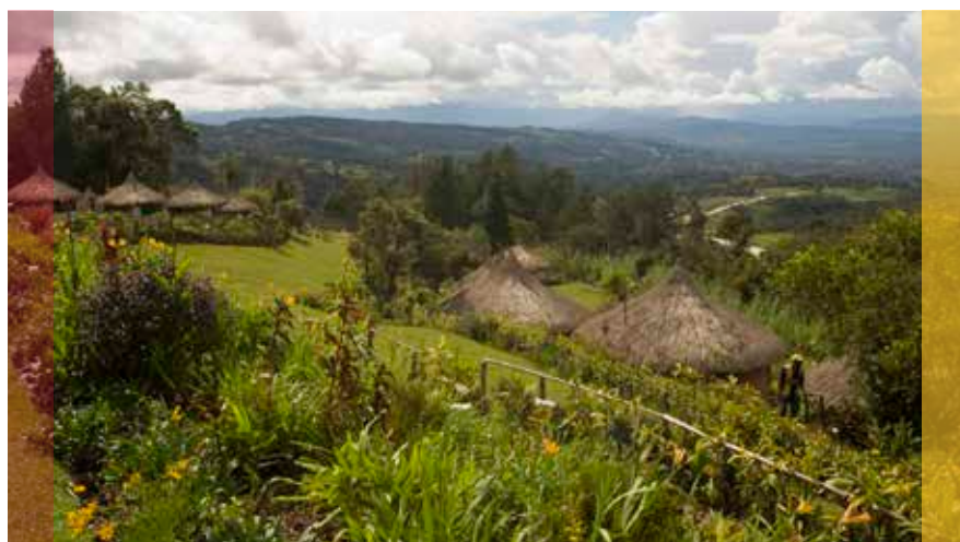
Hela Province, Highlands Region

PNG's MDG Progress Report (2010) reveals that the country achieved some of the country-tailored targets set in the Medium Term Development Strategy 2005-2010, particularly on MDG 1 (poverty reduction) and MDG 4 (child mortality), but did not achieve any of the internationally agreed MDG targets. It is encouraging that, since coming to power in 2012,