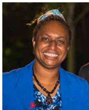
Pictured Left: The Minister for Youth, Community Development and Religion launches 'The Future We Want – Voices from the People of Papua New Guinea' on UN Day, 24 October 2013

development agenda. A comprehensive report, 'The Future We Want – Voices from the People of Papua New Guinea' was endorsed by the Prime Minister in 2013 and was officially launched by the Minister for Youth, Community Development and Religion at our UN Day event on 24 October.