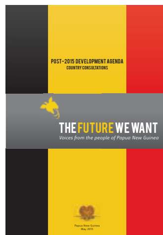
Pictured Left: The National Post-2015 Report: The Future We Want – Voices from the People of Papua New Guinea.

The results were validated at a technical level, followed by the political validation of government officials and development partners. The findings have informed the Country Report of PNG, which was endorsed by the Prime Minister in May 2013 and shared at the UN General Assembly in September 2013.