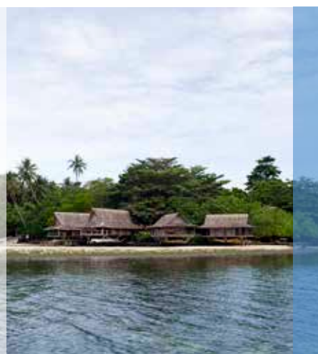
New Ireland Province, Islands Region