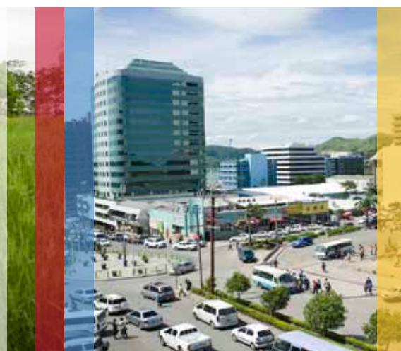
National Capital District, Southern Region