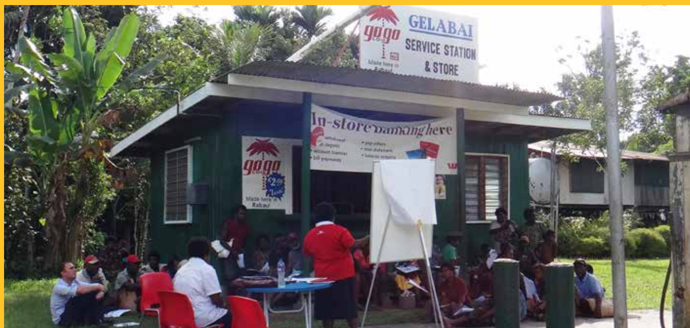
Gelabai In-store Banking branch, East New Britain Province

This commitment is part of the National Financial Inclusion and Financial Literacy Strategy that will be endorsed in early 2014 by the National Executive Council, with technical and financial assistance provided by the UN.