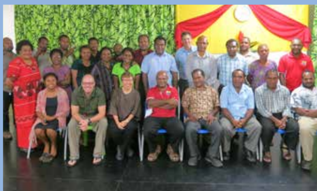
Field epidemiology trainees and their mentors, Port Moresby

The graduation ceremony for the first cohort took place in November at the NDoH in Port Moresby. After this successful first course, future FETP trainings are planned. The aim is that selected graduates from each cohort will be provided with additional training so they can serve as future FETPNG mentors and epidemiology leaders in PNG.