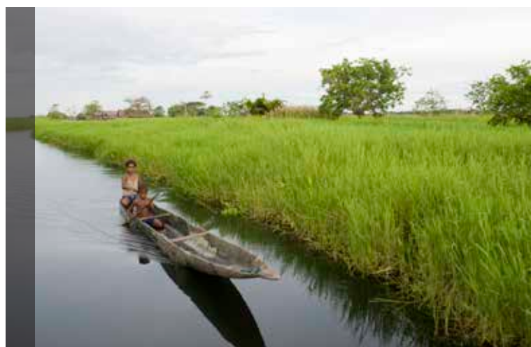
East Sepik Province, Momase Region

PNG first became a troop contributing country to UN peace-keeping operations in 2011. In 2013, PNG continued to send select defense force personnel to observe operations in Sudan and South Sudan. The government has stated its intention to increase troop contributions for future international missions.