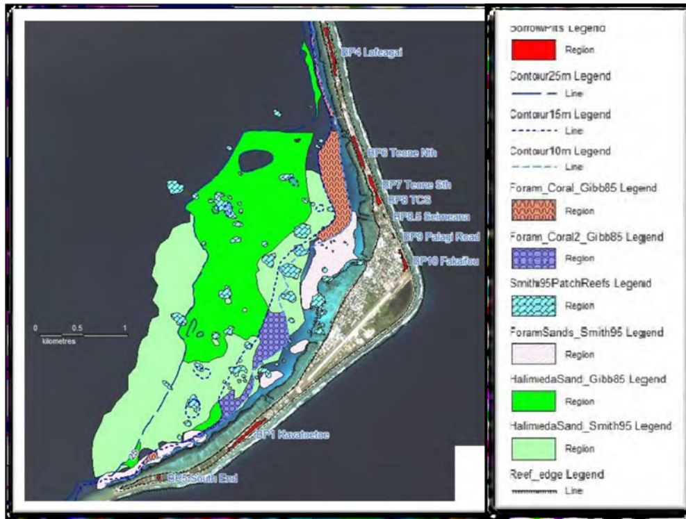
Figure 1 Lagoon sediments available near Fogafale islet as mapped by Gibb (1985) and Smith (1995).

96. The sediment is typically characterised as Halimeda-rich gravelly sand and sandy gravel, with occasional localised areas of foraminifera-rich sand. The sediment typically contains only traces of silt, which is a favourable characteristic in terms of reducing the potential for turbidity and sedimentation associated with dredging.