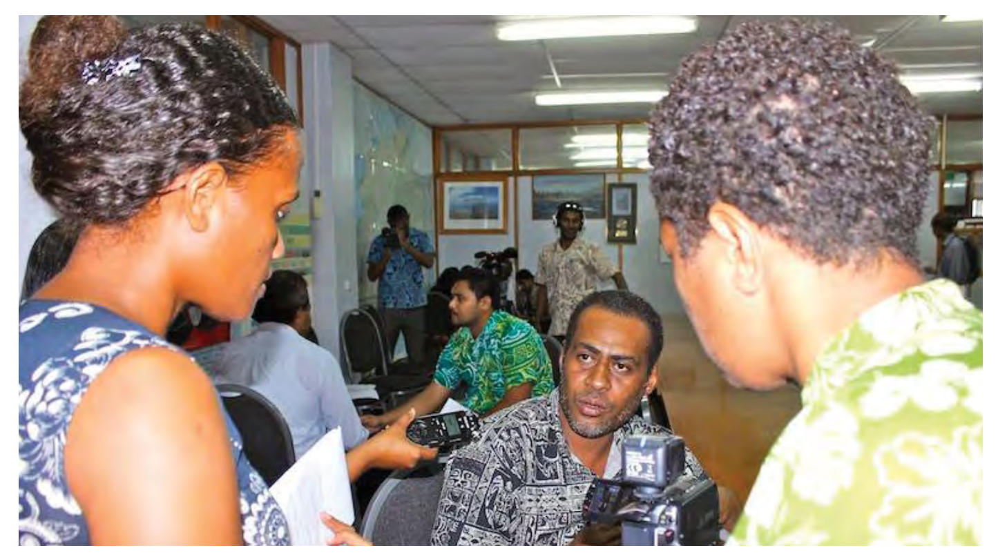
Press interview. Fiji Ministry of Health.

Extreme care should be taken when dealing with information on social media. Be aware that, while it may be a good source, it must stand up to the rigour of intensive investigation and meet all the requirements of the Media Code of Ethics.