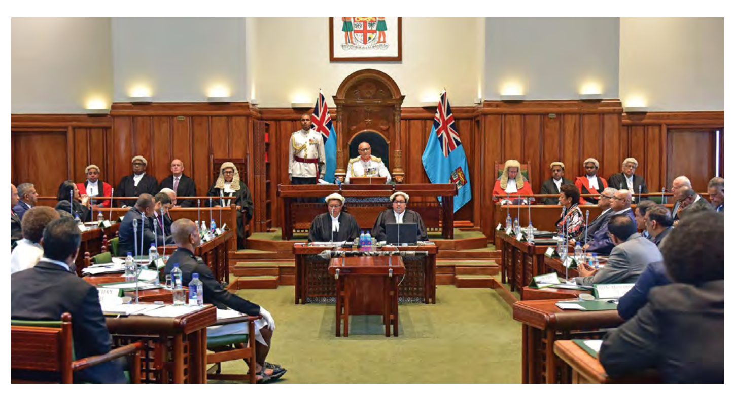
Opening of The Fijian Parliament.