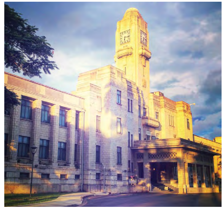
Fijian Parliament Building.