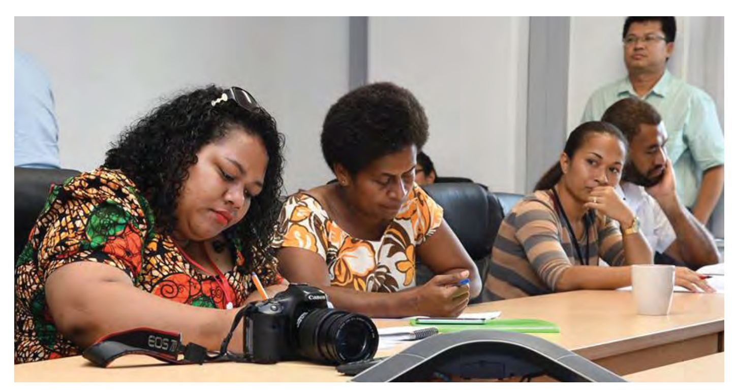
Members of the Fijian media at a press conference.