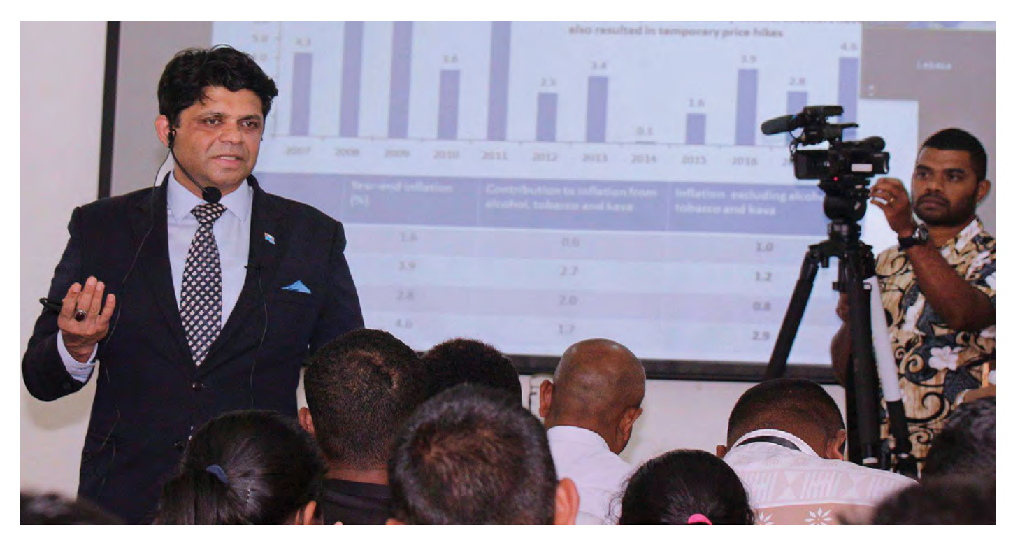
Attorney-General and Minister for Economy, Public Enterprises, Civil Service and Communications and Minister for Economy, Hon. Aiyaz Sayed-Khaiyum, 2018/19 Budget Roadshow.