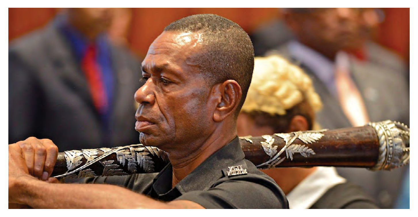
The Mace represents the authority of the Speaker in the House.