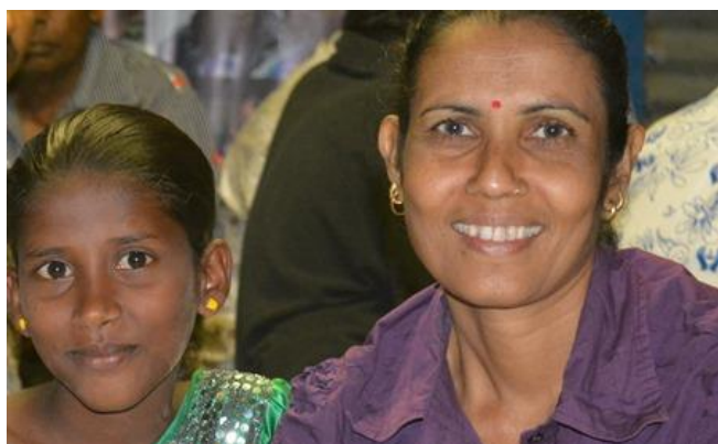
Taganikula Settlement, Namuka District, Macuata Province, Northern Division.