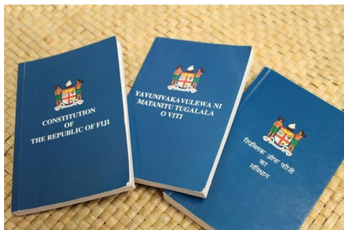
Constitution of the Republic of Fiji in three languages.