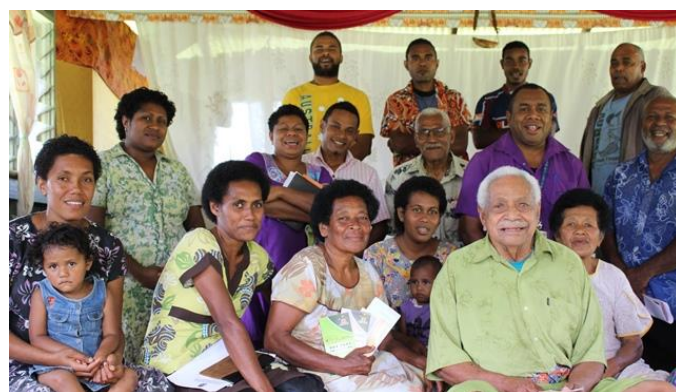
Dawara village, Wailevu District, Cakaudrove Province, Northern Division.