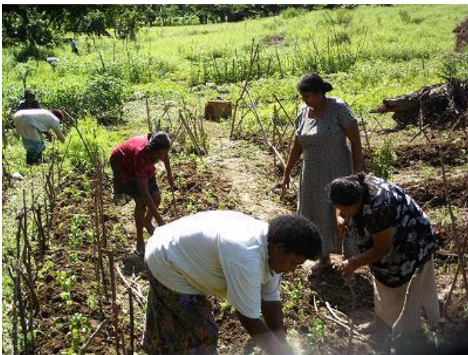
During the CFW programme, communities replanting roots crops and vegetables.

Through the CFW programme, the participants were able to spend money earned, on food, health and education addressing their immediate and basic family needs. The programme also resulted in women's empowerment by enabling them to supplement household incomes, bringing nutritious food home and developing their skills for better livelihoods activities. Simultaneously, the programme has contributed to increased sense of cohesiveness among family and community members as well as improved relationships between the two main ethnic groups in Fiji; iTaukei and Indo-Fijian.