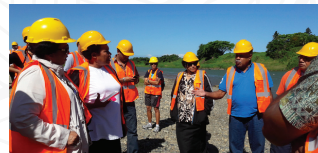
Members of Parliament on a field visit during the workshop on Extractive Industries

Key to ensuring that the Fiji Parliament is effective in implementing its legislative, oversight and representation functions is the capacity of MPs. Following on from an initial induction programme for MPs after the September 2014 election, FPSP has rolled out a professional development programme for MPs consisting of trainings, workshops, conferences, attachments in other Parliaments and field visits.