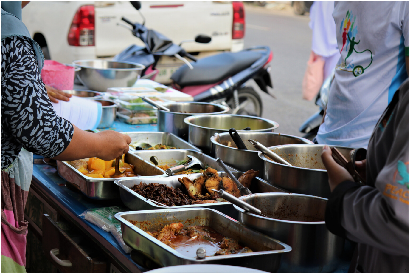
Street food in Pattani (Thailand, 2019)