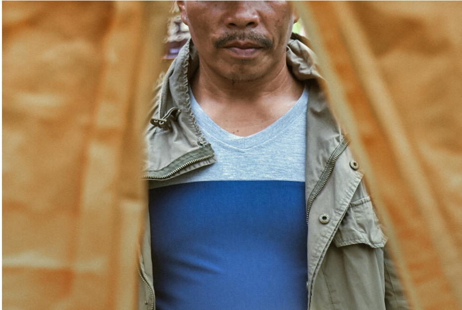
Odin (Philippines, 2019)