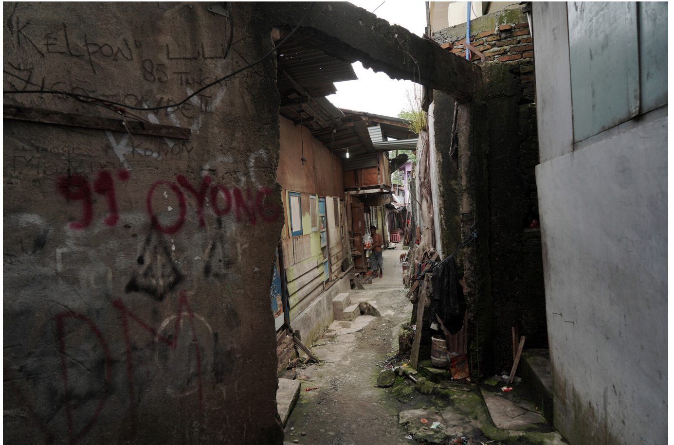
An alleyway in the densely populated area in Kampung Kubur, Medan, North Sumatra (Indonesia, 2019)