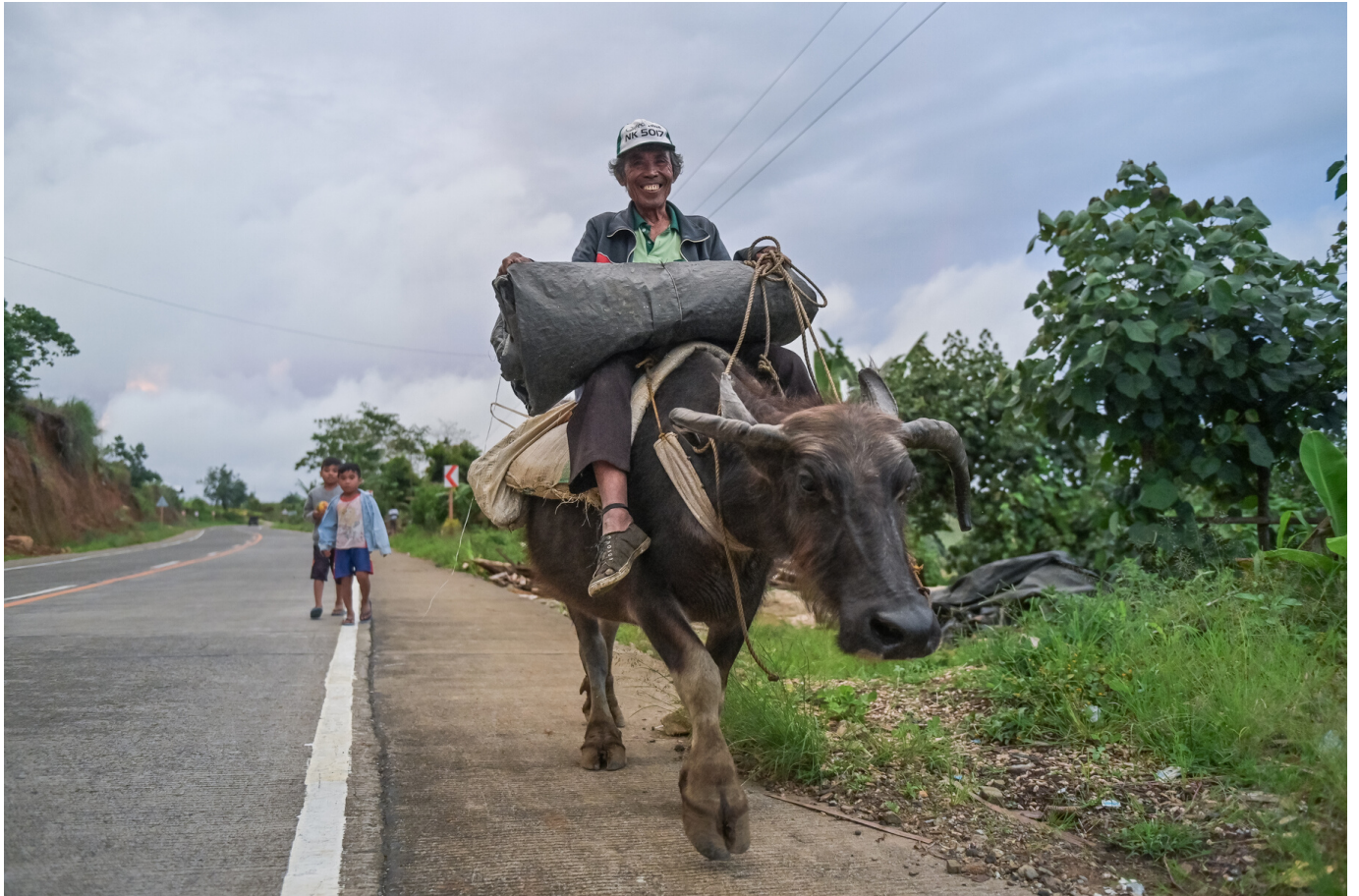
A man rides a buffalo in Alamada, Mindanao (Philippines, 2019).