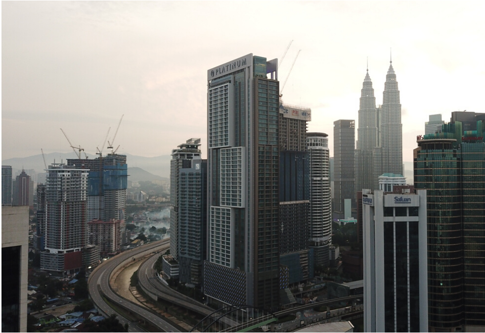
Panorama of Kuala Lumpur, with the Petronas Twin Towers (Malaysia, 2019)