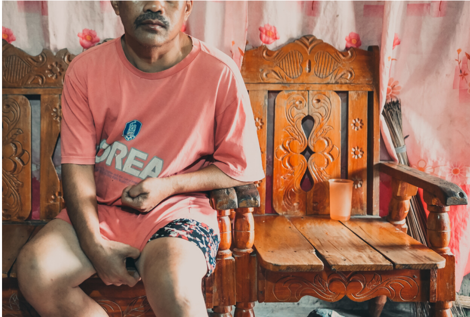
Jumar (Philippines, 2019)