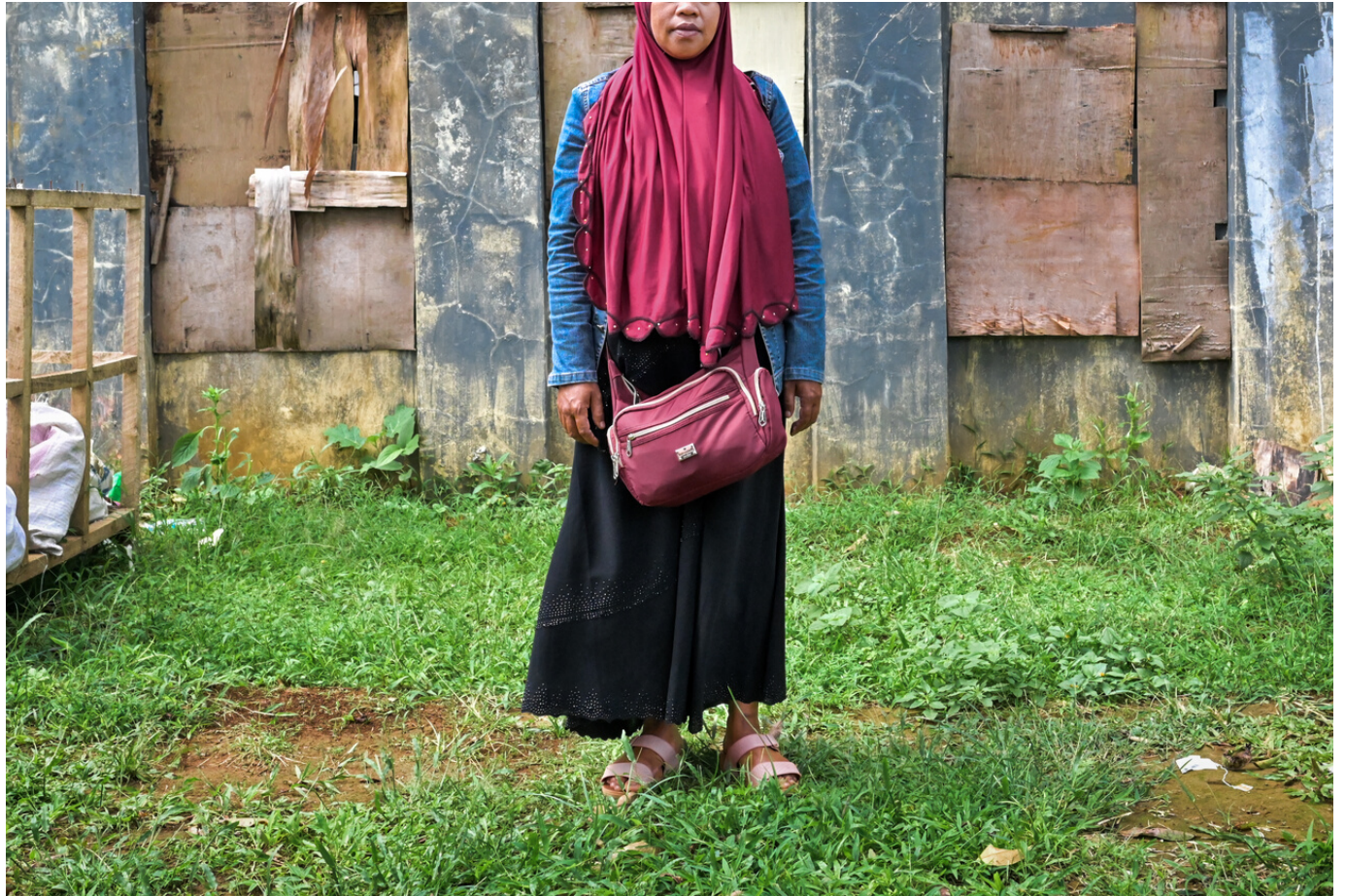
Ummu (Philippines, 2019)