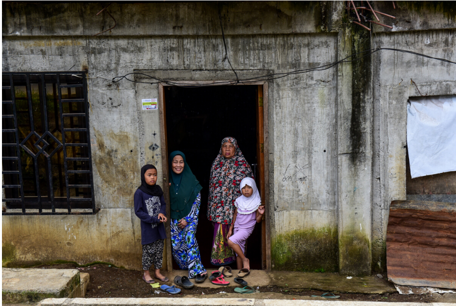
Four at a door in Lanao del Sur, Mindanao (Philippines, 2019)