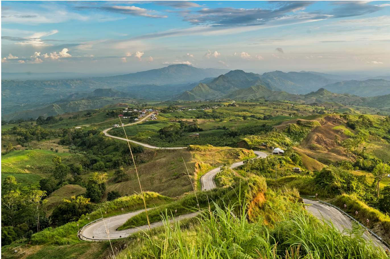
A view of the Banisilan - Guiling - Alamada - Libungan Road in Mindanao (Philippines, 2019)