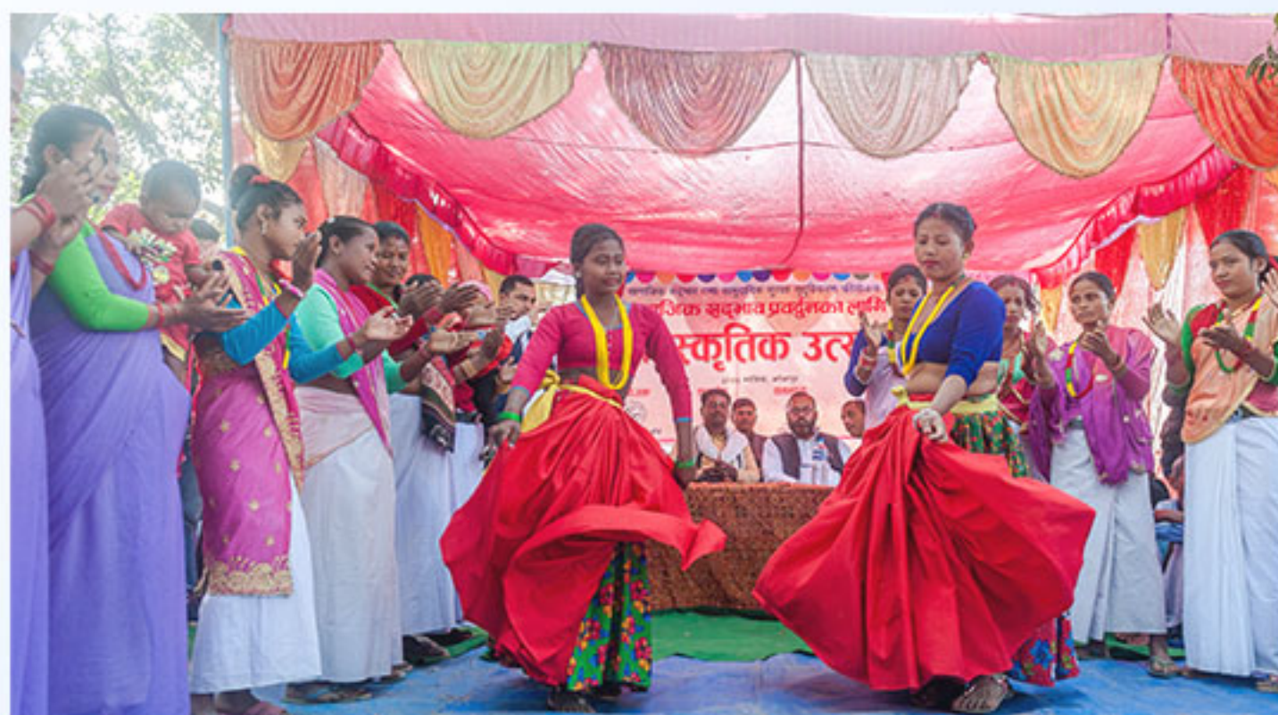
Tharu women performing in multicultural festival in an event organized to promote social cohesion in Matehiya, Banke, Province no. 5

After promulgation of the new constitution in late 2015, Nepal experienced an upsurge of discontents coupled with mistrust among communities based on their ethnic identities, political beliefs and regional identities regarding the federal restructuring and equitable participation. Confrontational politics and spiraling tensions created deep and widespread social rifts that have the risk of being overlaid during the transition to federalism and implementation of the new constitution.