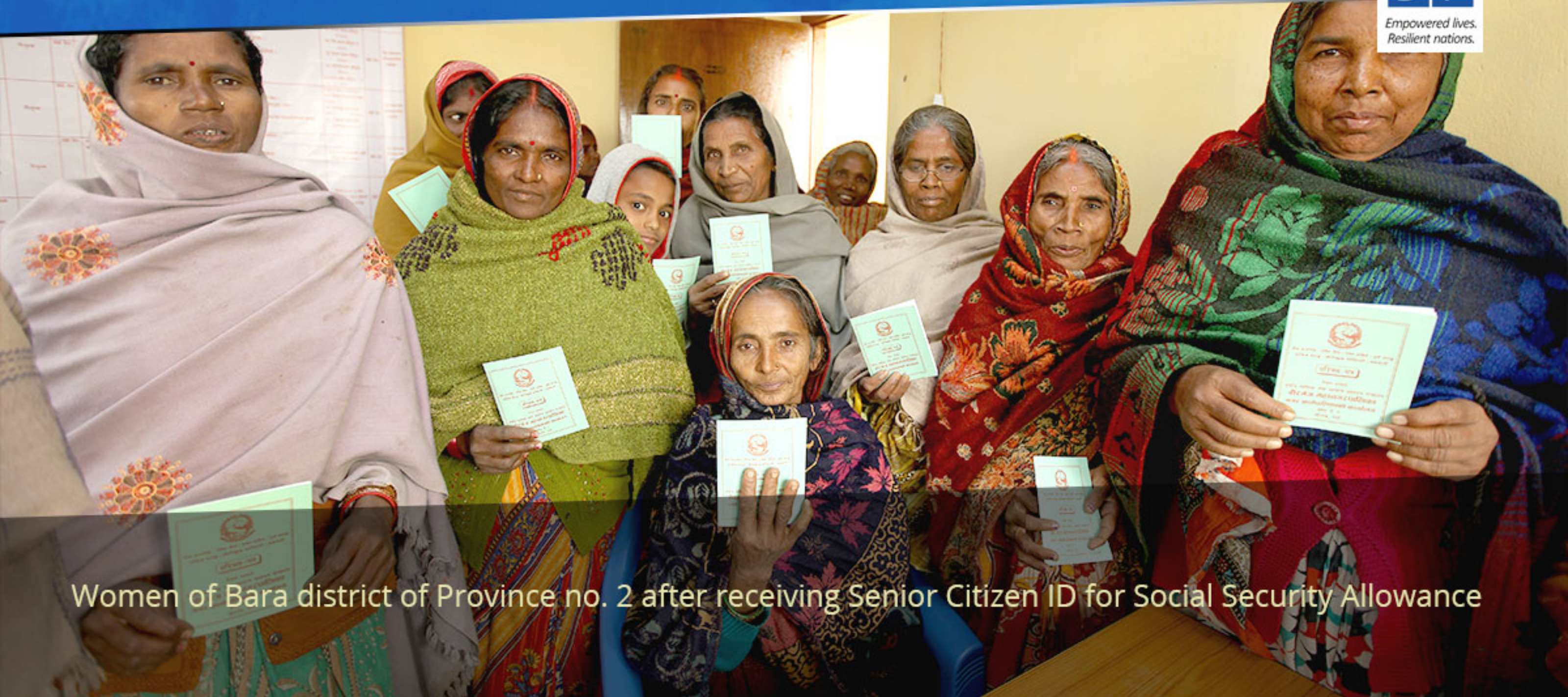
Women of Bara district of Province no. 2 after receiving Senior Citizen ID for Social Security Allowance