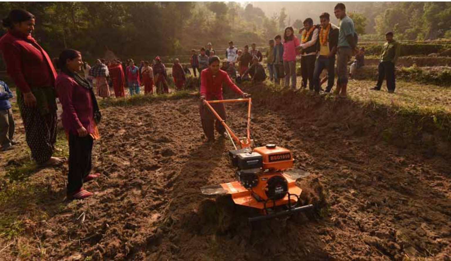
Women working their fields with the tiller