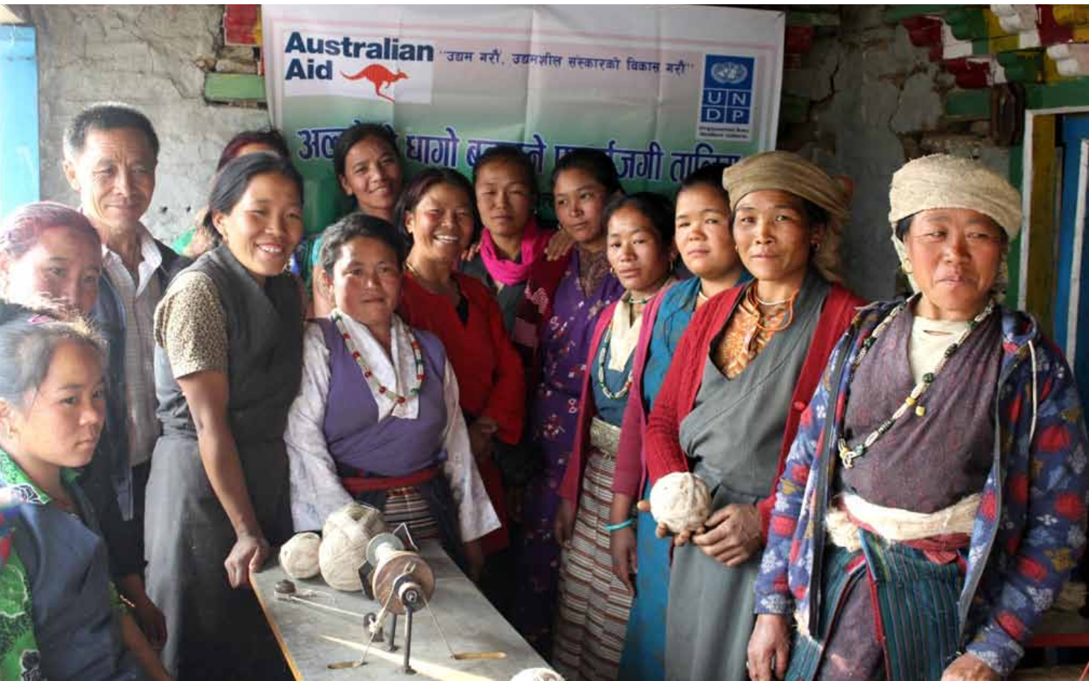
Stinging nettle makes them happy!