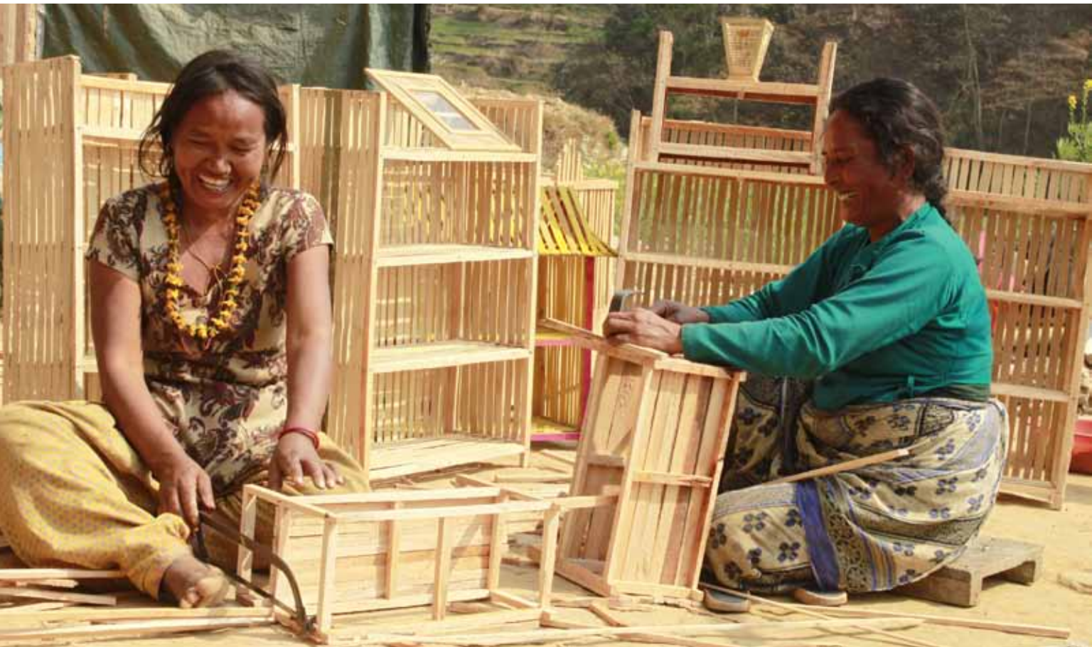
The women are happy making bamboo products for their livelihood