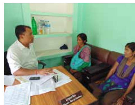
Victims of domestic violence seeking for legal aid at the Socio-Legal Aid Centre (SLAC) in Kailali

Project districts: Dadeldhura, Kailali, Bardiya, Surkhet, Dailekh (2013) Kanchanpur, Achham, Dang, Salyan, Kapilbastu, Myagdi, Syangja, Bara, Mahottari, Sindhupalchowk, Jhapa, Morang, Saptari (2014)