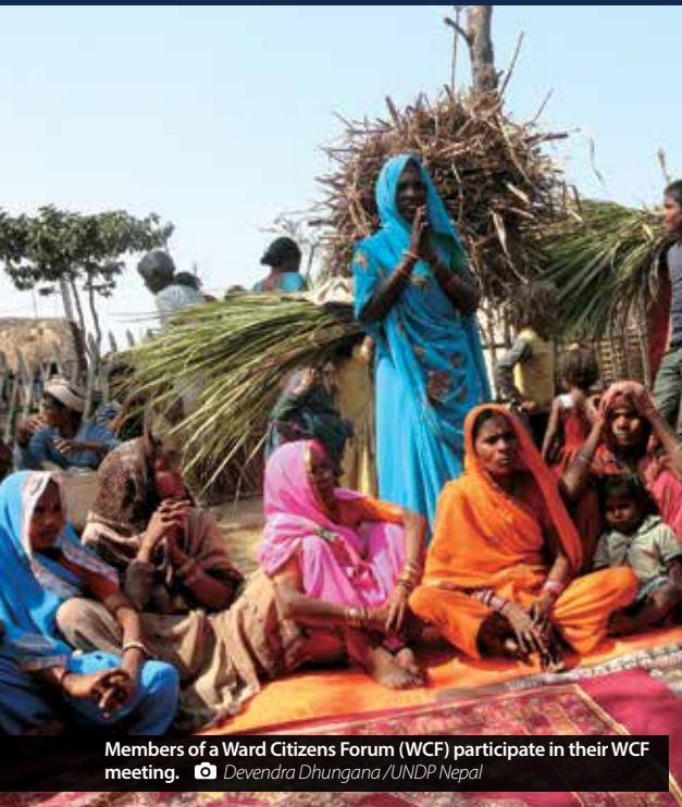
Members of a Ward Citizens Forum (WCF) participate in their WCF meeting.