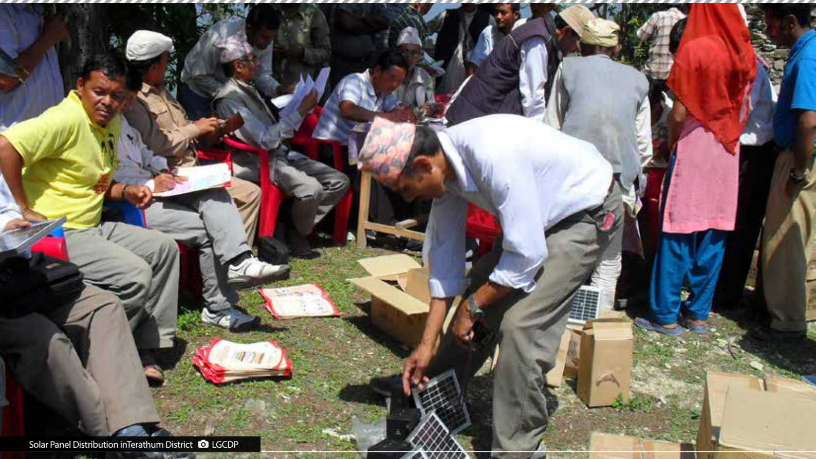
Solar Panel Distribution in Terathum District LGCDP

The programme facilitates implementation of governance reform, service delivery and capacity development, citizens empowerment, socio-economic and infrastructure development. UNDP is responsible for small technical component of this multi-donor project.