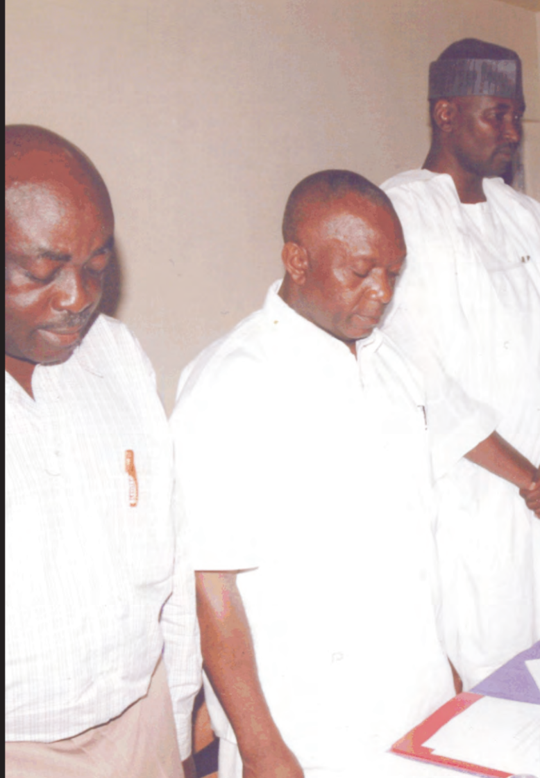
Participants at the 2 Day Follow-up Workshop at Sokoto

It is hoped that the lessons learned from this exercise will become a training model to be applied in every local government of all the states of the Federal Republic of Nigeria.