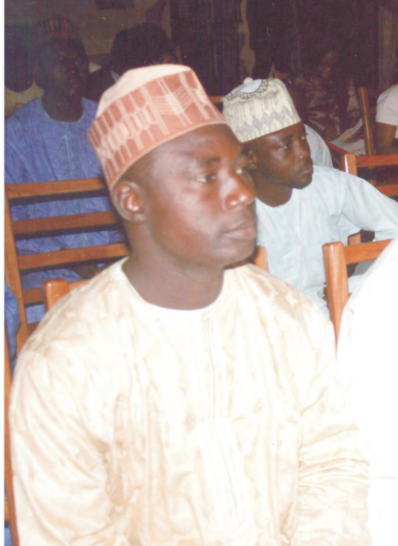
▶ Participants at the 2-Day Follow-up Workshop in Sokoto State

"This follow-up is primarily to assess the impact of the training on grassroots engagement with budget processes in the LGAs selected and profile lessons learnt to serve as input into scheduled training on budget processes in other states of the federation".