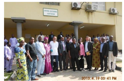
Fig 7: Cross section of organisers & resource persons

a. International Seminar on Community-Based Conservation of Endangered Sclater's Monkey ( Cercopithecus sclateri ). GEF-SGP Nigeria National Coordinator was a Resource Person at the first International Seminar on Community-Based Conservation of Endangered Sclater's Monkey ( Cercopithecus Sclateri ) which was organized by one of her grantees (Biodiversity Preservation Centre) in collaboration with the University of Uyo, Akwa Ibom State, Nigeria. It was a well-attended meeting with other resource persons from Nigeria and Rome, Italy. The meeting underscored the importance of conservation and especially scientific and fact based conservation, indigenous participation and political will in order to make a great positive impact in conservation. Some of the endangered species of animal endemic to Nigeria and Akwa Ibom in particular were highlighted and there was a general call to the academic/research institutions, donors and corporate organisations for concerted effort to prevent total extinction of these species.