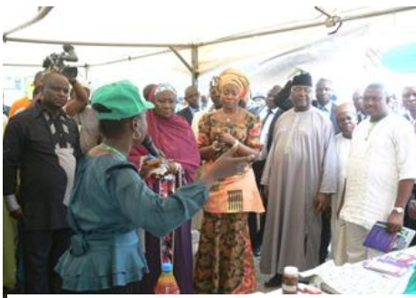
Fig. 4: SGP exhibition applauded by dignitaries

The increasing impact of SGP activities in Nigeria cannot be over emphasized. GEF-SGP impact was again recognized and applauded by the First Lady of Benue State, Mrs. Yemisi Doshima Suswan; the Deputy Governor, Stephen Lawani (OFR?); Benue State Commissioner for Environment and other dignitaries at her exhibition stand during the 8 th National Council on Environment (NCE) meeting held in Benue State between the 5 th and 10 th , May 2013 where only 10 SGP grantees showcased some of SGP products and projects results.