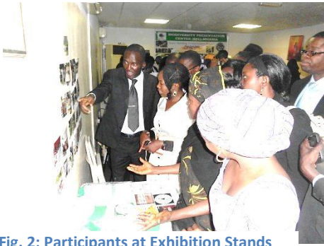
Fig. 2: Participants at Exhibition Stands

SGP also organized the first exhibition of her projects during the workshop to showcase some of the products/results of SGP projects in the country. Over 20 grantees participated and several SGP products were on display. The various products displayed during the exhibition included herbal products, craft works, irrigation pitchers, products from Nypa palm such as ethanol and fronds, energy saving cooking stoves, tree seedlings, improved agricultural products produced using composting among others.