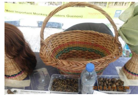
Fig 6: Products on display during exhibition