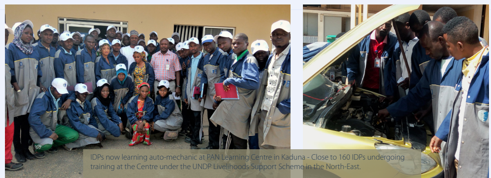
IDPs now learning auto-mechanic at PAN Learning Centre in Kaduna - Close to 160 IDPs undergoing training at the Centre under the UNDP Livelihoods Support Scheme in the North-East.