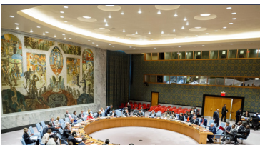
UN Security Council adopts first Resolution on Boko Hara after visiting Nigeria