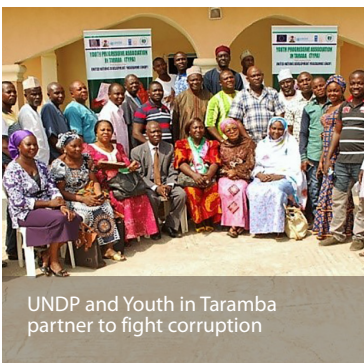
UNDP and Youth in Taramba partner to fight corruption