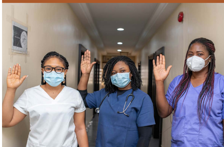
Women in leadership on the frontlines of COVID-19