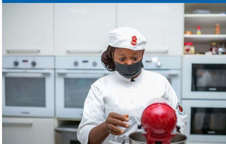
COVID-19: Ending violence against women and girls