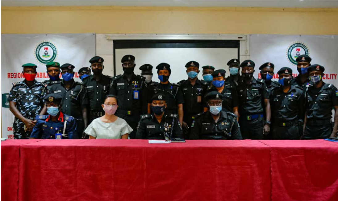
We hosted a workshop to increase the capacity of law enforcement officers on key concepts of human rights, humanitarian law and SGBV to promote its practical application in our six Regional Stabilisation target communities.