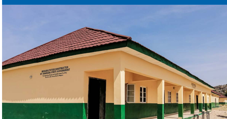
Improving social contract through the rehabilitation of formal learning Centers