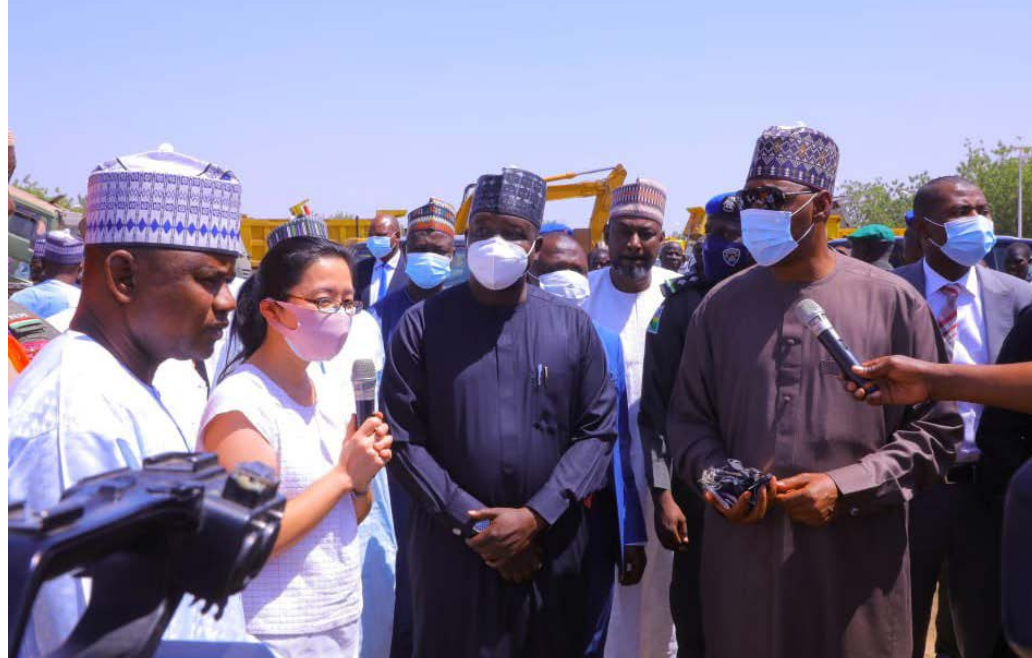
We recently handed over to the Borno State Government heavy equipment to facilitate the construction of basic amenities as part of our Regional Stabilization Project as well as vehicles to support the EU Waste Management project in Maiduguri.