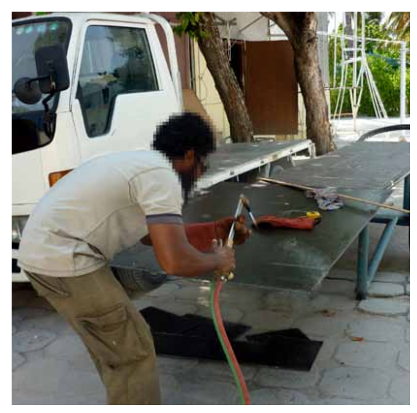
Prisoner at work - Maafushi Prison

Stage 2 - The DPRS would need to get a memorandum of understanding signed between the institutes willing to offer this