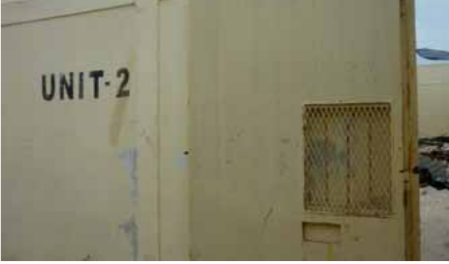
Medical Centre (top) and Unit 2 - Maafushi Prison