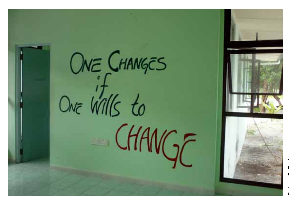
"One Changes if one wills to change"