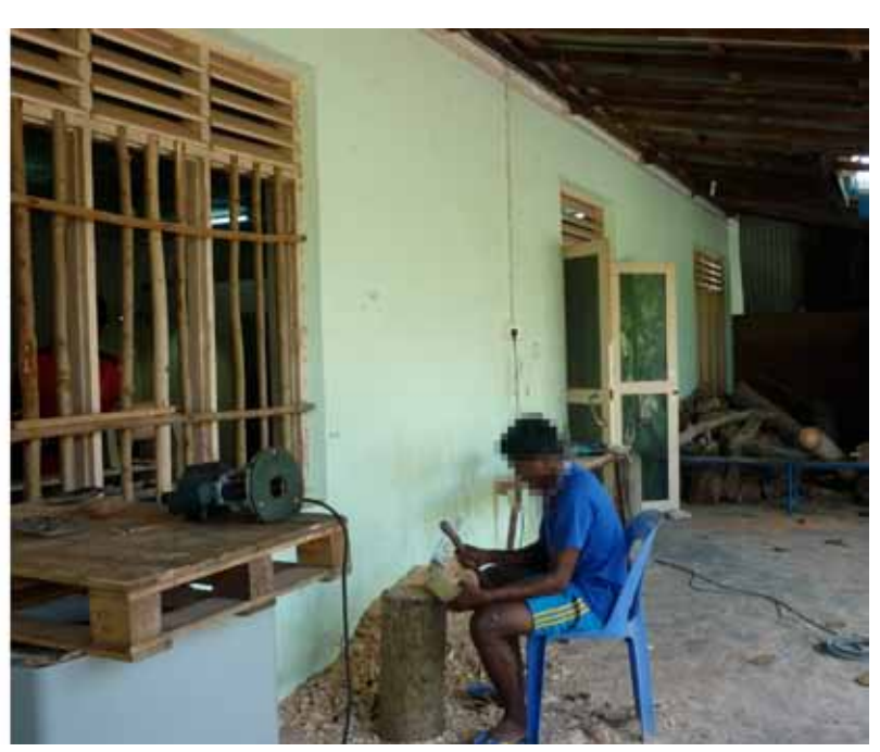
Prisoners at work - Asseyri Prison, Himmafushi