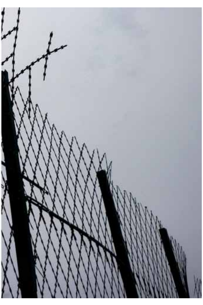
Security fence - Maafushi Prison