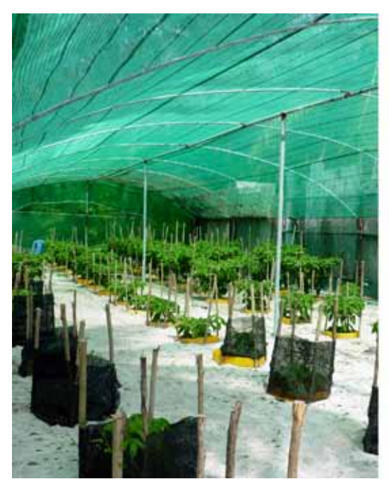
Asseyri Prison - Himmafushi

Stage 3 - Training for experience: Once the prisoner has acquired a qualification (foreigners and women included) they will be qualified to apply for a job within the prison industry. The first 3 to 6 months after the qualification they would be required to remain as trainees and would be on voluntary employment. Once they have completed this stage they can be employed with salary in the prison industry.