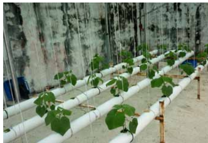
Prisoners at work - Asseyri Prison, Himmafushi