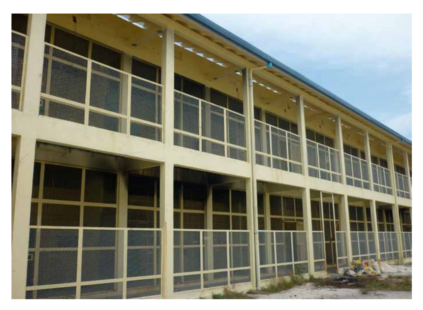
Infamous U2 - Maafushi Prison