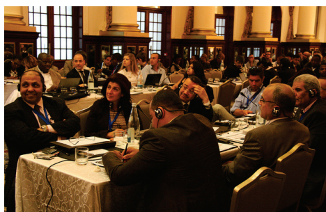
Participants from different countries at the Maputo workshop

Two senior officials from the Elections Commission (EC) went on an exposure trip to Maputo, Mozambique from March 4th to March 8th, 2013, to attend a workshop on 'Sustainability in Electoral Administration'. The activity was undertaken by the Integrated Governance Programme (IGP) of the United Nations Development Programme (UNDP), under its result area on "Deepening democracy for a resilient and peaceful society in the Maldives", supported by the UK Foreign Office and the Commonwealth Office.