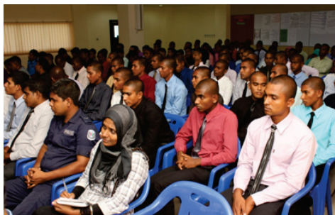
Participants at the 'Thursday Forum'