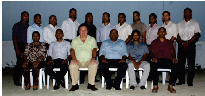
ToT on Community Engagement Policing

The IGP was able to contribute meaningfully in the areas of strengthening the institutional capacity of the Maldives Police Service and towards enhancing police accountability and transparency. Interventions were conducted in consultation and coordination with three key 'rule of law' actors in the country; Maldives Police Service (MPS), Elections Commission of the Maldives, and Human Rights Commission of the Maldives. As a result, substantial groundwork has been laid in a short period of time with great potential for long-term sustained results.