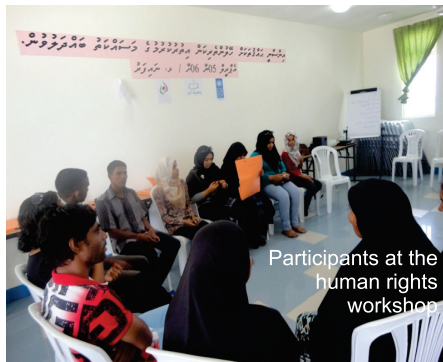
Participants at the human rights workshop