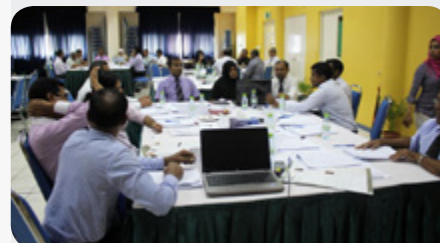
Participants at the Atoll Councillors Forum.

Participants at the forum included Presidents of City and Atoll Councils, board members of LGA and policy level representatives from ministries.