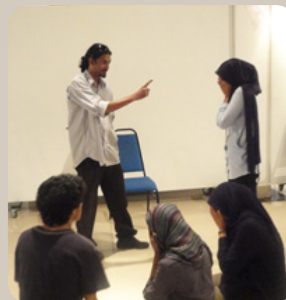
A CBT performance

"Finally, after 8 years, we were able to share our stories with each other"