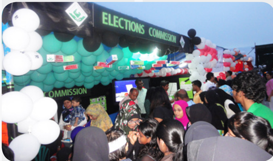
Elections Commission stall providing information to the public at a UNDP-supported event.

The symposium aimed to create awareness of RTI among policy makers, facilitate sharing of experiences and international best practices, and create demand and culture a deeper