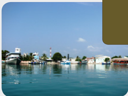
Harbourfront of Naifaru Island.