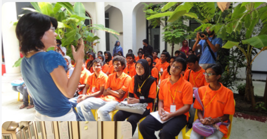
Information sessions for the participants.