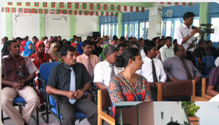
Official inauguration ceremony of the NGO Forum.

Following the NGO Forum, commitments were made to look into re-establishing the NGO advisory committee to the Registrar of NGOs with UNDP's technical support, establishing awards for outstanding NGOs, establishing an NGO development unit in MoHA, and holding the forum as an annual event. UNDP will also