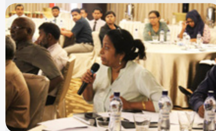
Discussion at the local Governance and Community Mobilization Forum.

In December 2012, UNDP also supported the hosting of the first Atoll Councillors Forum, to share experiences towards strengthening decentralization processes and increasing operational effectiveness of councils.