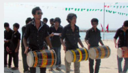
Youth group perform cultural music to welcome visitors to the NGO Forum, supported by UNDP Maldives.

Welcome to the very first issue of The Good Governance Advocate, the newsletter of the new Integrated Governance Programme of UNDP Maldives. We hope you find these periodic updates on the work of UNDP Maldives on Democratic Governance, useful and informative.