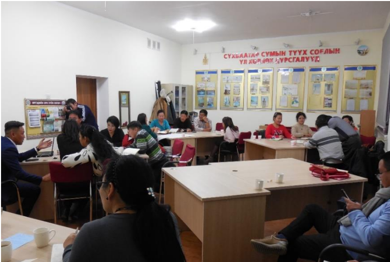
Group discussions underway with citizens from Selenge Aimag.

These meetings and discussions whether with officials, with elected representatives and citizens, or NGOs and consultants, did not just provide information about project progress, but more importantly they provided a vital sense of the working of democratic processes and the value attached to relevant and appropriate change to strengthen representative bodies. Those we met acknowledged the unique work of the project and recognised the definitive contribution in