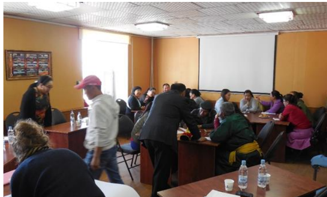
Group discussions with community at Bayanchandmani soum