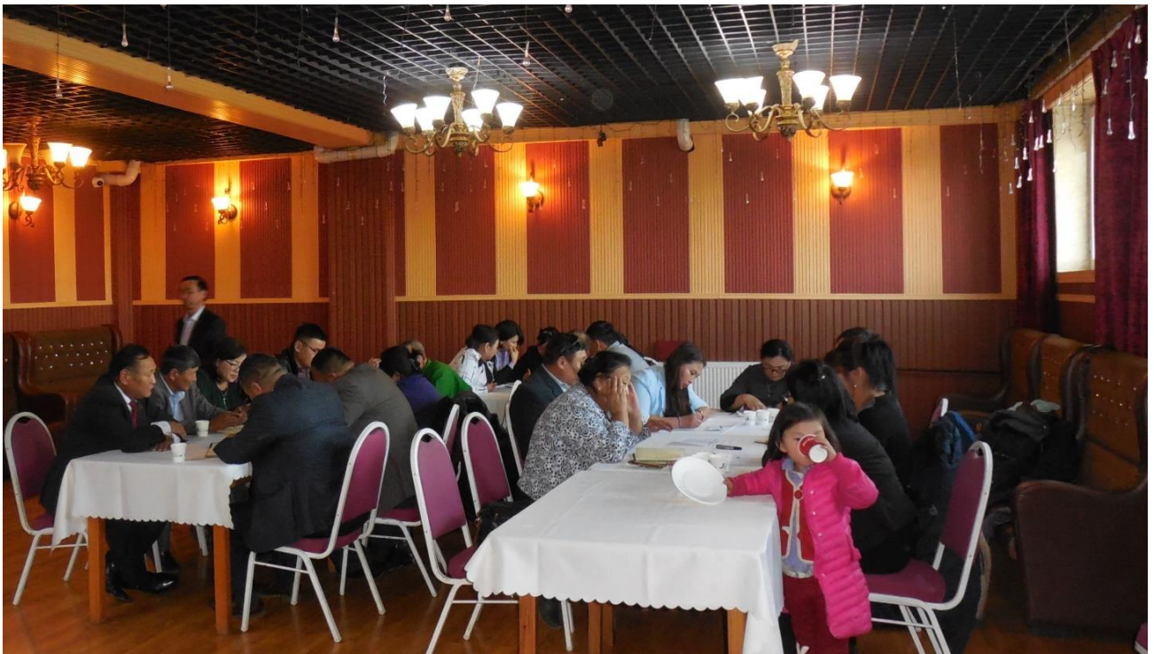
Participants preparing charts in groups. Soum hurals, bagh Chairs and grant recipients from Bayanchandmani, Bornuur, Jargalant, Altanbulag soums of Tov aimag