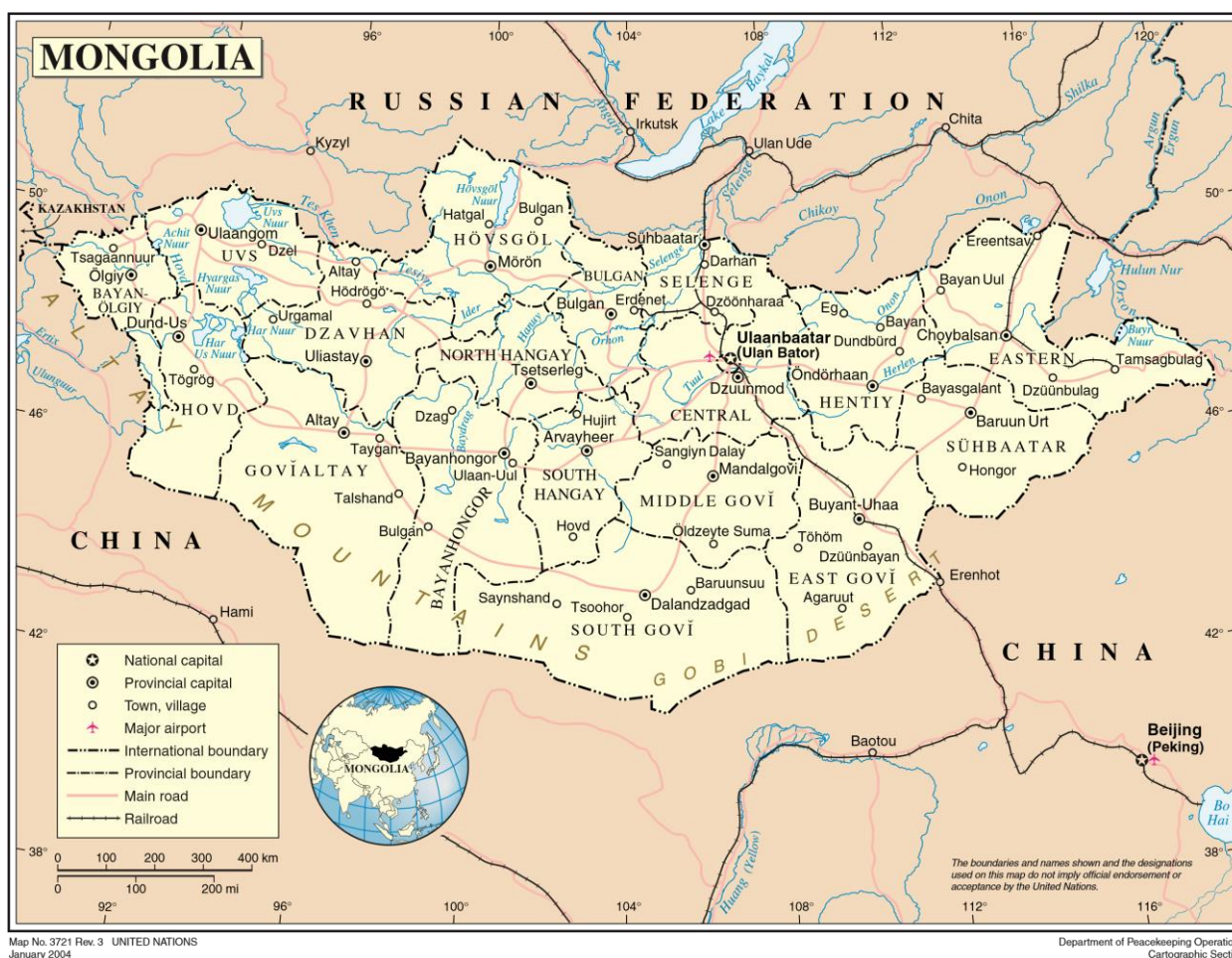
Figure 1 2

Mongolia is a unitary state with a central government and three tiers of sub-national governments. The territory of Mongolia comprises of 21 aimags and the capital city, with a total of 330 soums and 1612 baghs (rural) and 9 districts and 152 horoos (urban). According to the Constitution of Mongolia, the administrative and territorial units are organised on a combination of both self-governance and state administration. The Constitution defines self-governing bodies in aimags, the capital city, soum and districts as Citizens' Representative Hural (CRH) (referred hereafter as hurals) of their respective territories; in baghs and horoos as general meetings of citizens. Currently, there are over 8000 elected representatives in the aimag, capital city, soum and district CRHs. 1