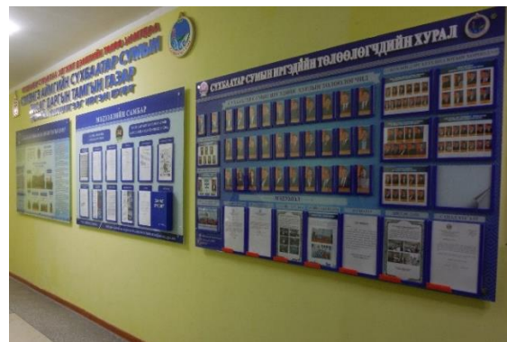
A corridor of information display at Sukhbaatar, aimag center of Selenge