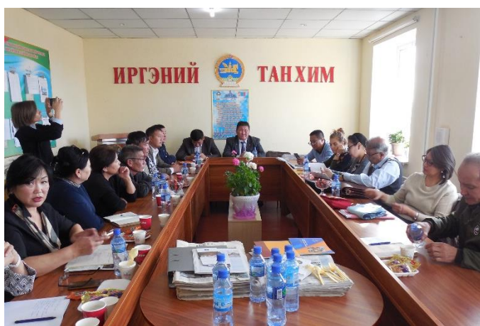
At Javkhlant soum, Selenge Aimag

The MTR team (see Annex 3 for information on MTR Team) along with project team visited the following soums, aimags, district for interaction in the field with elected representatives, citizens, and officials at the respective levels. All interactions outside Ulaanbaatar took place in the aimags of Selenge and Tov.