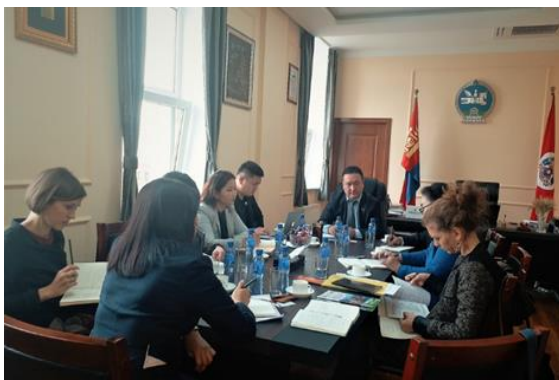
Meeting with Khan-Uul district hural

* (These are changes as compared to the earlier functioning of hurals prior to the training being imparted.)