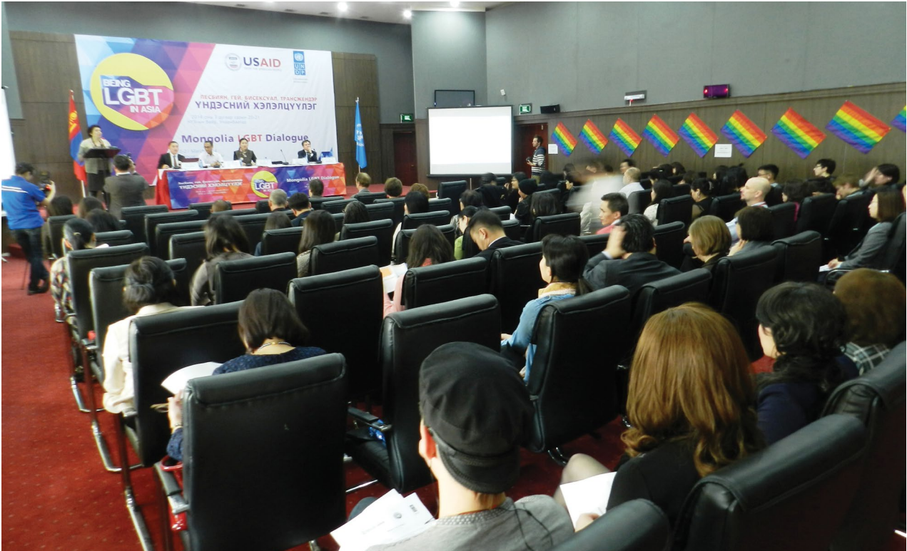
Participants listen to speakers at the Mongolia National LGBT Community Dialogue

attended the second day's proceedings of which 25 were from various government agencies. A total of 17 people were from international organizations, including UN agencies. USAID's Regional Development Mission in Asia and the USAID Mongolia Mission attended the Dialogue as well as other development partners. Mongolian civil society was represented by 13 participants from NGOs such as the LGBT Centre, Youth for Health, Together Center, Support Center and Positive Life, National Center against Violence, Mongolian Youth Federation. The event also had participants from academia (National University of Mongolia, School of Journalism), researchers and the media. A total of nine journalists attended.