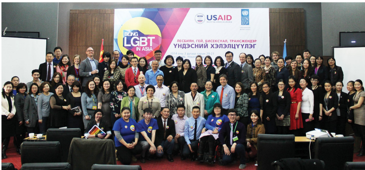
Group photo of all the participants from the Dialogue