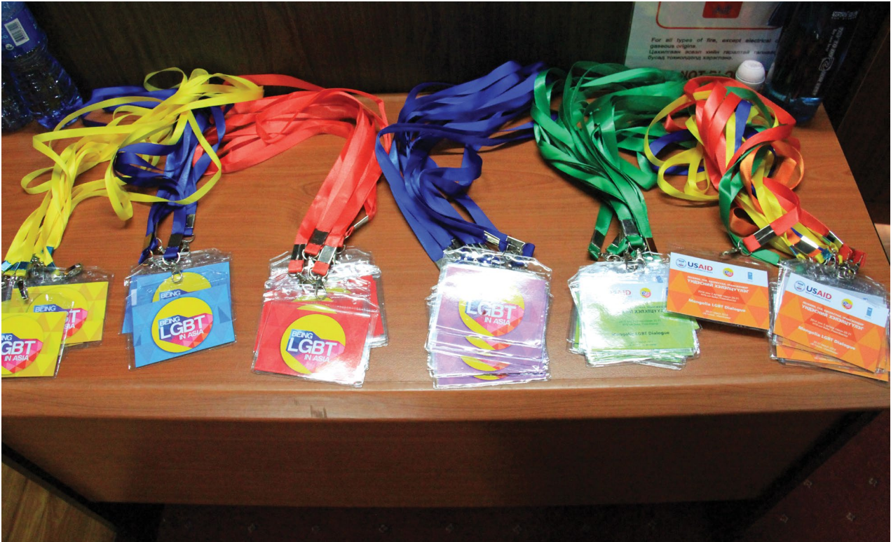
Colour-coded name badges used to divide participants at the Dialogue into six thematic groups

“BP is a gay man. In April 2005 his uncle, who works in police, called him and beat him up with a baton when he heard that his nephew lives with a foreign man in Beijing. As a result, his torso, leg and buttock sustained serious injuries. The following day, refraining to turn his uncle to the police, he departed Mongolia.” (LGBT Centre, 2012)