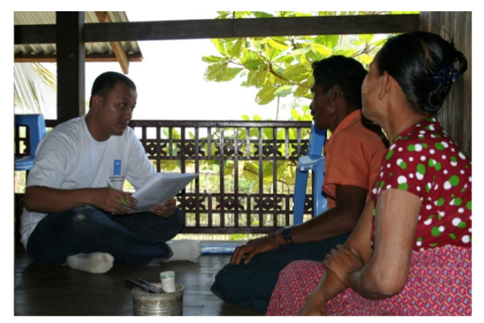
Citizens Report Card interview in Mon State.

In each state/region, a number of sample townships are selected for the data collection. In the pilot states of Mon and Chin this number was six, but in the subsequent states/regions, three townships have been selected. Within each township, two sample village tracts/wards are selected. The selection of townships, village tracts and wards takes place in close consultation with the state/region governments.