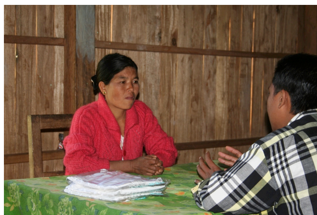
Interview with a primary school principal in Chin State.

The methodology for the local governance mapping was adapted from methodologies successfully applied in various countries around the world, especially those suited to countries where there is a limited availability of reliable data on service delivery and the quality of governance, as is the case in Myanmar.