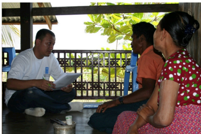
Citizens Report Card interview in Mon State.

In each state/region, a number of sample townships were selected for data collection. In the pilot states of Mon and Chin this number was six, but in most subsequent states/regions, there were three townships, while in some larger states and regions like Sagaing or Shan there were four or more. Within each township, two sample village tracts/wards were selected. The selection of townships, village tracts and wards took place in close consultation with the state/region governments.