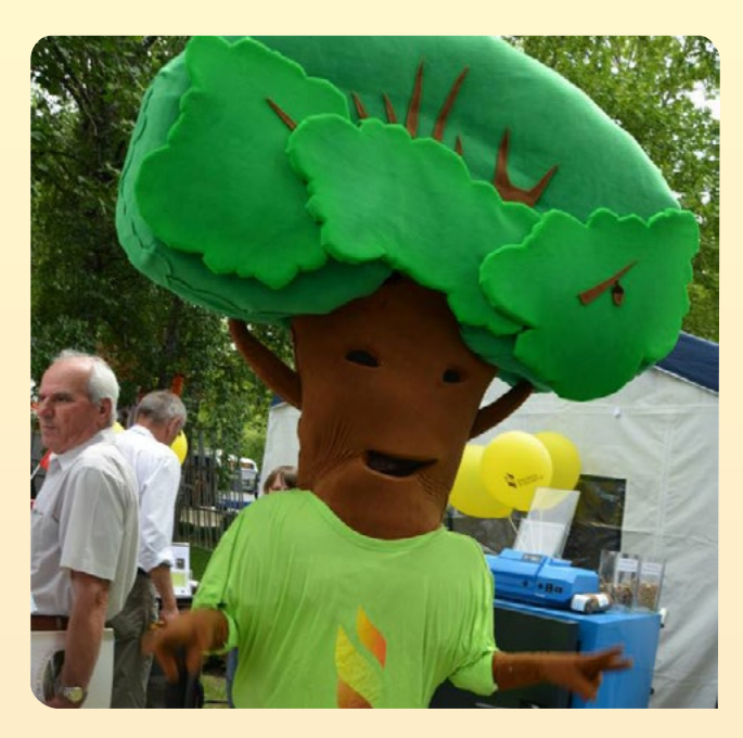
ENERGEL WAS THE BIOMASS ENERGY ADVOCATE IN THE EUROPEAN TOWN

The Energy and Biomass Project Team took part in the events dedicated to the European Union Days in Chisinau held on 18 May. The Project was actively involved in organising knowledge competitions in the area of renewable energy and energy efficiency for children and adults, presented information on the benefits brought by biomass energy. The European Pavilion accommodated the companies accredited within the Programme targeting the households, which exposed boilers manufactured or assembled in Moldova and demonstrated the boiler operation principles to visitors. Also, the Project Team organised an exhibition of solid biofuels, disseminated