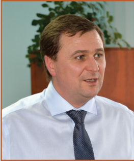
Serghei PALIHOVICI Deputy Secretary General of the Government, State Chancellery of the Republic of Moldova

The Government of the Republic of Moldova reiterates its commitment in promotion of local autonomy, decentralization, development and transparency in local decision making, as part of the actions of European scale and importance.