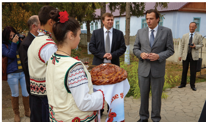
A delegation of officials and mayors being welcomed at Sculeni town hall (Ungheni)

During the first visit, interested parties were able to get acquainted with Larga Town Hall's team work peculiarities, in ensuring transparency in the activity of local authorities.