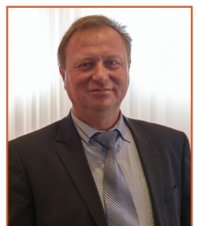
Radu URECHEAN, mayor of Larga commune (Briceni)

Sarata-Galbena local authorities pay special attention to the interaction with the village's residents. Many beautiful things were created in the commune, but none of them would have been possible without the people's support. This is why we strive to enhance the people's trust in the institution of local government. However, attaining such a desideratum is possible only through transparency and communication.