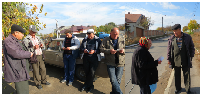
Residents of Rusești (Ialoveni) reading the Citizen's Guide to know their rights

It was established that the adopted rules shall be applied in the process of development and approval of draft resolutions with a potential economic, environmental and social impact. Additionally, the announcement of organizing public consultations in these areas shall be made public at least 15 business days before outlining the final version of the draft resolution.