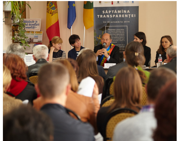
Sărata Galbenă residents gathered at the Transparency Week launching ceremony

During the Transparency Week, citizens from more than 30 municipalities from 17 districts of the state became closer to their local Town Halls and Councils. This is all due to the fact that between October 13 to October 19, mayors, local councillors, but also community opinion leaders have conducted more than 150 local activities.