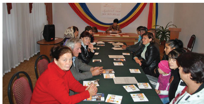
Local councillors explaining local residents the steps, acts and decisions to be taken in order to receive social support

From October 13 to October 19, in Sarata Galbena commune, there were conducted several activities devoted to the Transparency Week. Besides the official national launching of the local radio station and development of the local newsletter, Town Hall employees together with local councillors held a public lecture on: “Social Aid – Steps, Acts, Decisions” and the public debate on “Ways of improving the access road on Yuri Gagarin Street”.