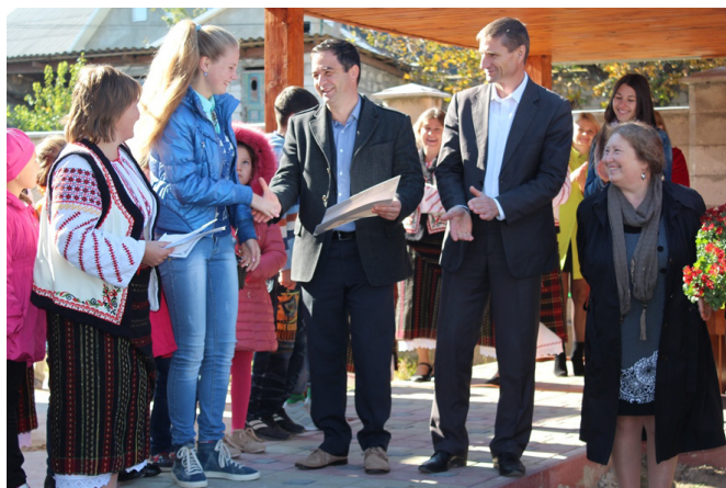
Reopening of the „Elena Alistar” Public Library in Răzeni (Ialoveni) following renovation

During 13-19 October, in Razeni there were distributed tens of copies of the Citizen's Guide. Local councillors have discussed with several groups of residents on administrative transparency and citizen involvement in local decision-making.