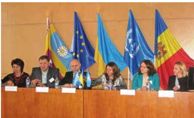
Mayors from Moldova and Ukraine discuss positive experiences in local development

From the mayor's comments, we found out that Colibași is a multilaterally developed village, one of the most populated villages in the country, with over 6,000 inhabitants, according to last census in 2004.. Being a large village Colibași has a range of cultural and educational objectives, such as two kindergartens with nearly 250 children, the school, which is considered one of the biggest on the bank of river Prut which in 1998 was awarded obtained the status of “high school.” Not only local children but also children from neighbouring localities Brînza and Vadul lui Isac study here. In the village there are two libraries, where children can cultivate a love for books: a school library, and the village public library. The health system is quite advanced here with a hospital that serves both the local population, as well as neighbouring villages. This is where patients are diagnosed and