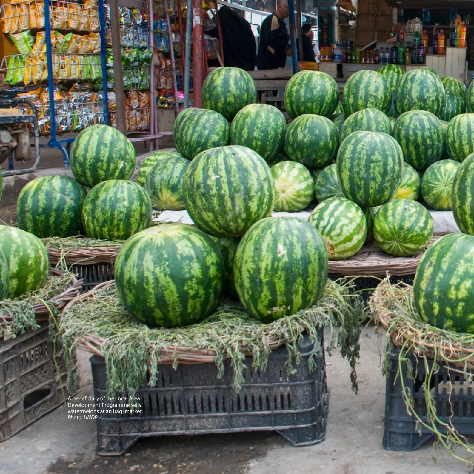
A beneficiary of the Local Area Development Programme sells watermelons at an Iraqi market.