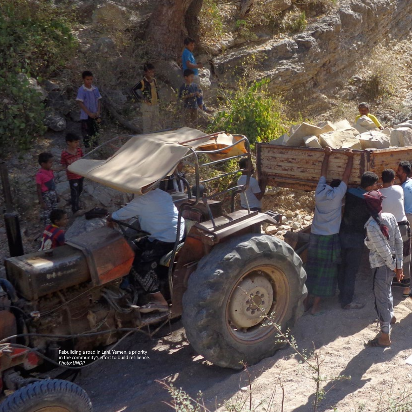
Rebuilding a road in Lahi, Yemen, a priority in the community's effort to build resilience.