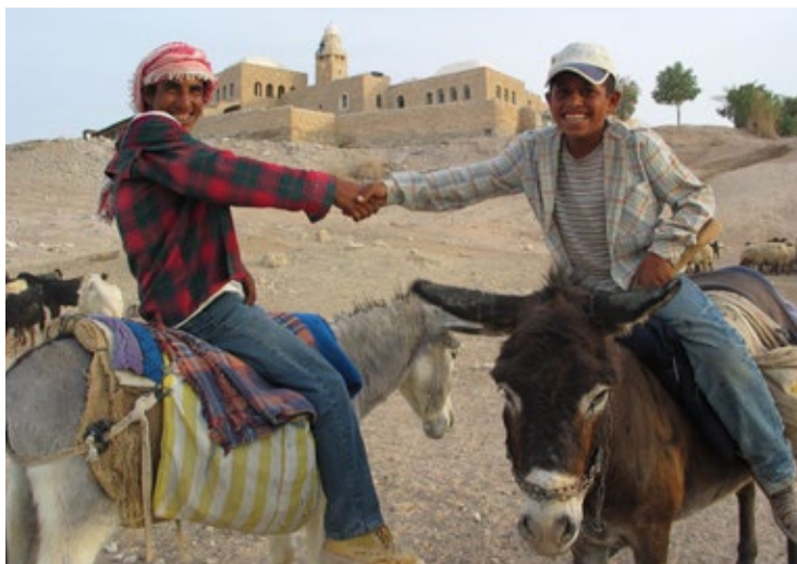
Members of the Bedouin community who will be benefiting from the rehabilitation of Maqam Nabi Musa in Jericho, in the background.

But much work remains to be done. To respond successfully to global crises, threats, and challenges, the international community needs an efficient multi-lateral system that is founded on universal rules and values. The Arab States region faces multi-faceted challenges of every type and size, and in the coming years the EU and UNDP will continue our joint effort to preserve peace, prevent conflicts and strengthen international security while keeping the region on a sustainable development path guided by the 2030 Agenda. No person or community should be left behind, and though the future will doubtless hold many unexpected challenges, one thing will remain constant – the EU and UNDP will always help more communities when we work together.