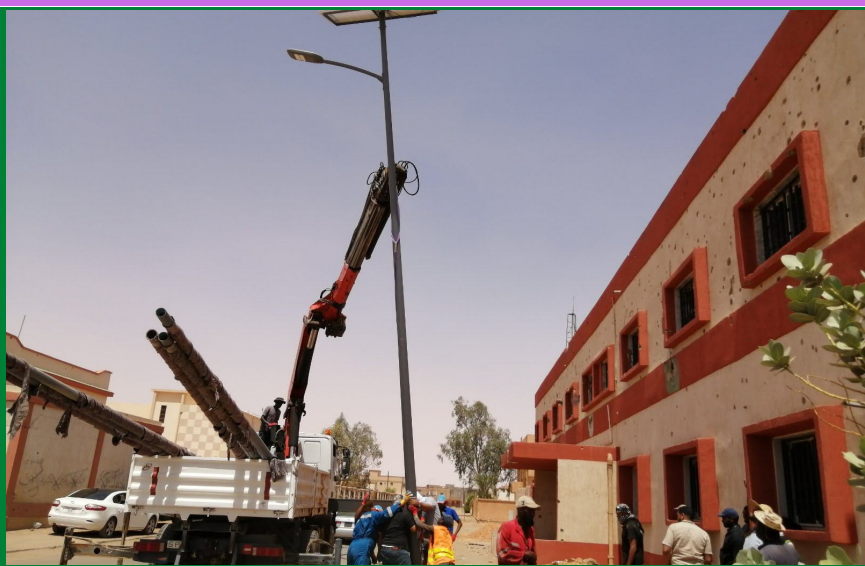
Ongoing work to install solar street lights

By the end of third quarter of 2020, the SFL had completed renovation of the library and the cafeteria at Ubari University and the Youth Social Center, and was preparing to hand them over to the end users. The educational institution hosts 3,000 students from Ubari and neighbouring cities. Installation of a 11 km solar street light system was ongoing during the monitored period.