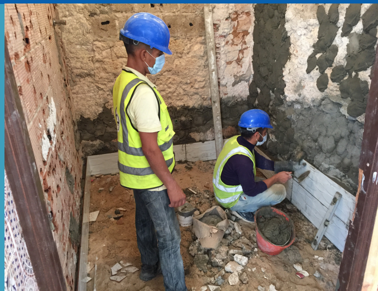
Ongoing work to renovate Al Kikhia Cultural House

During the third quarter of 2020, the SFL handed over the only completed project (Al-Ameer School) that is expected to accommodate 800 students. Five other projects were underway including rehabilitation of ICU, Newborn’s ward and Patients’room at Benghazi Children Hospital, Al-Kikhia Cultural House, Shohada Alsabi School, Benghazi Library and installation of solar street lights along 24 km. Works related to rehabilitation of Alhadayek clinic was advertised during this period.