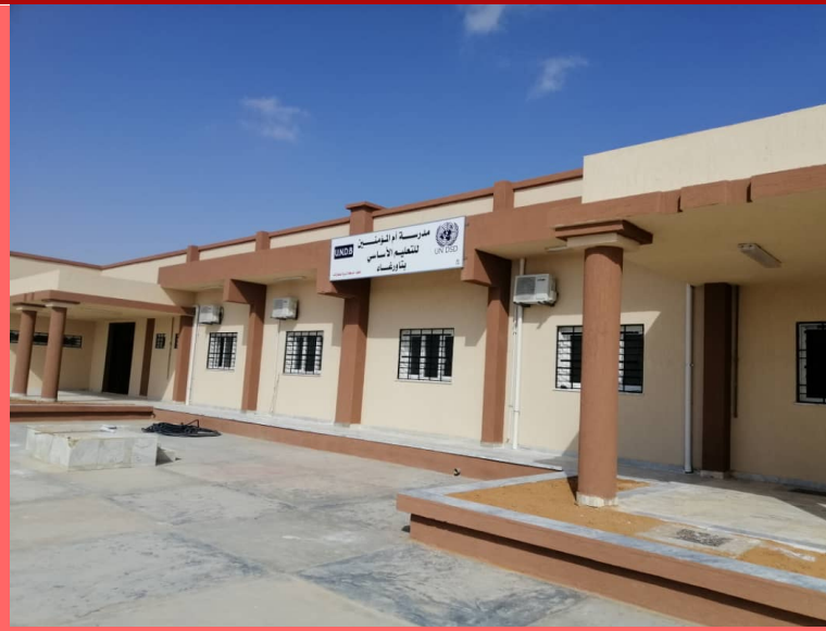
Um Al-Moamineen School , one the three renovated educational institutions

During the third quarter of 2020, the SFL provided the remaining equipment (Backup system and VSAT Internet) for the computer lab and furniture as well. Rehabilitation works of three schools (Al-Etihad Al-Afrike, Shohada Tawergha, and Um Al-Moamineen schools) were completed and handed over during the reporting period.