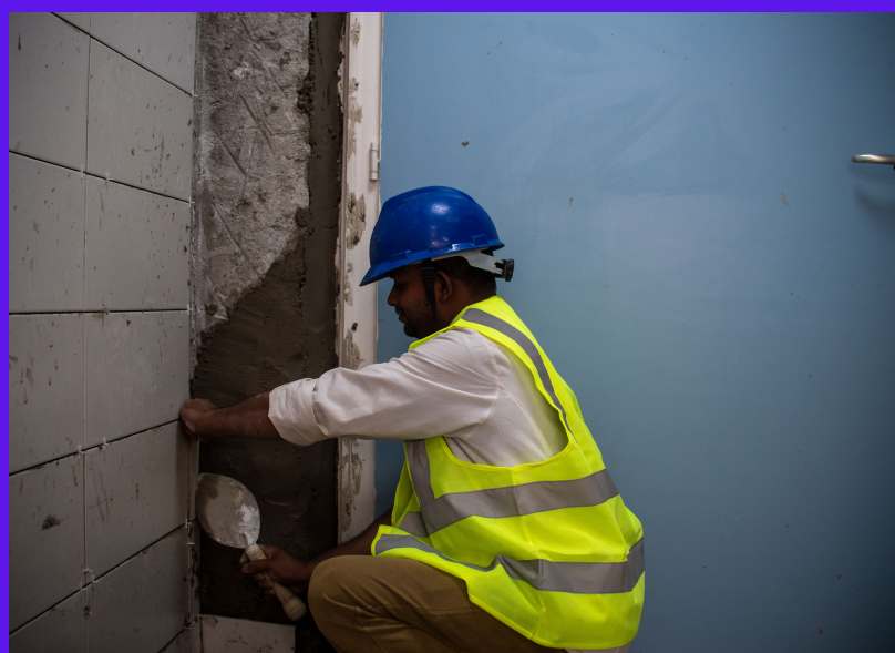
Ongoing work to renovate Ali Asker Hospital

By the end of third quarter of 2020, SFL has already completed renovation of 66 schools. It also supplied equipment consisting of eight refuse collector semi-trailers and two tractor heads to Hay Al-Andalus and Ben Gashir municipalities. More than 375,000 inhabitants of these municipalities will benefit from improved services as far as garbage collection is concerned.