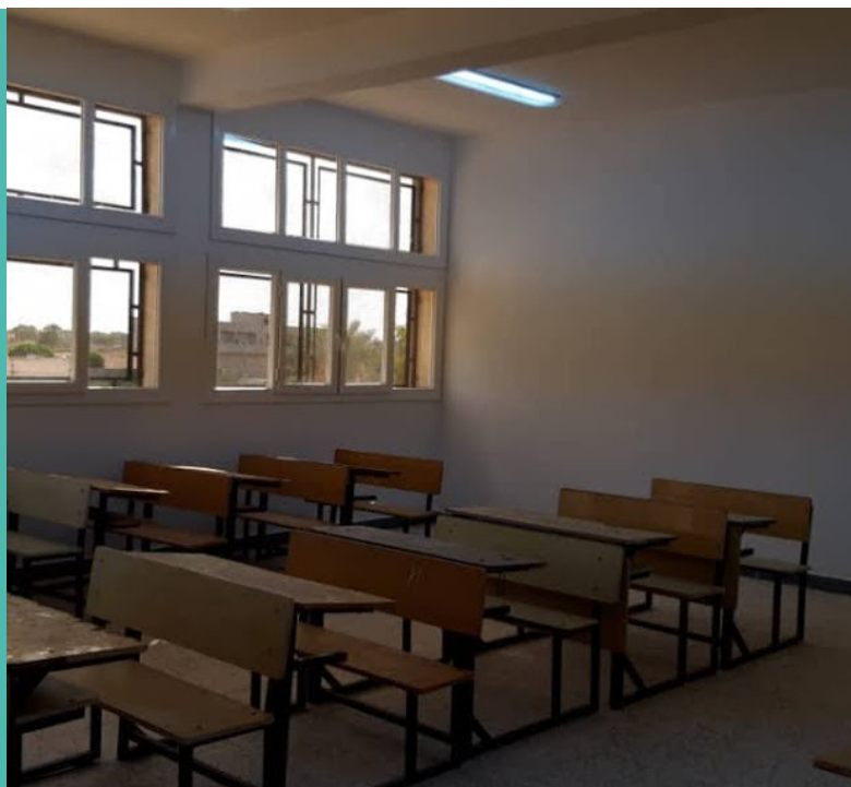
One of the already completed classrooms at Al Yarmouk School

By the end of third quarter of 2020, rehabilitation of Al-Yarmouk School was almost complete. The building is expected to accommodate more than 800 students when school activities will resume. Four additional projects will start in the next quarter including rehabilitation of Cold Chain Refrigeration Building along with Supply of Refrigeration Equipment, Omar Ibn Al-Asas, Talae Al-Naser and Salem Alshorfi Schools.