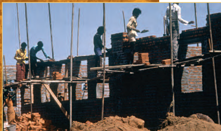
Steve Maines, UNDP

While the full impact of these risk reduction efforts will take several years to become manifest, some results have already started to show. For instance, the number of casualties in the flood season of 2006 dropped significantly and recovery efforts were notably more effective.