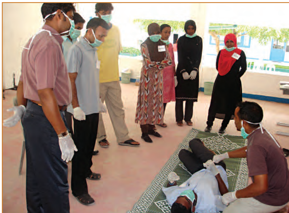
UNDP disaster preparedness training in the Maldives

Managing climate-related risks is a key development challenge. UNDP is partnering with the International Research Institute for Climate and Society (IRI) at the Earth Institute of Columbia University to link efforts to manage disaster risks associated with climate variability with initiatives to manage long-term risks associated with climate change.