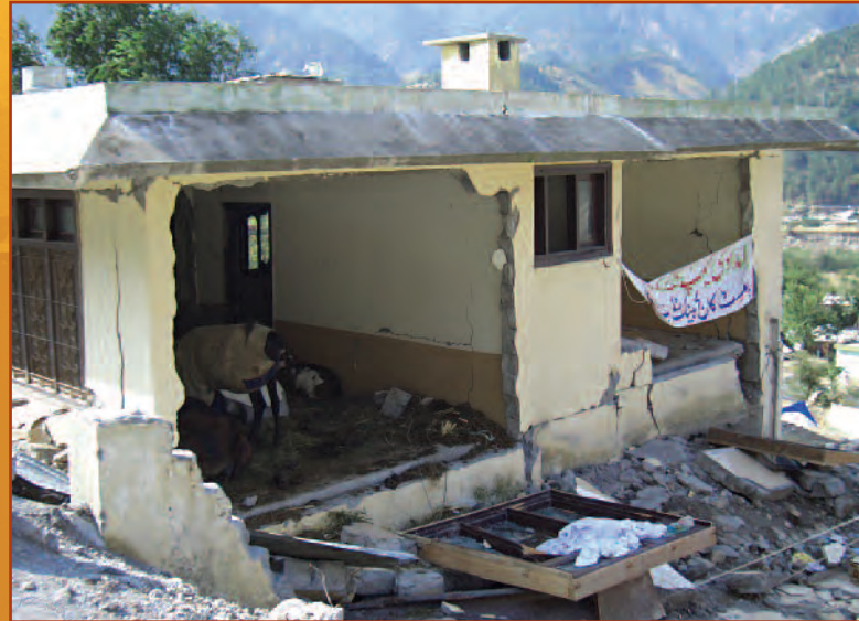
Asian Disaster Risk Reduction Center

UNDP is implementing an earthquake risk reduction and recovery preparedness programme in the South Asia region in collaboration with the South Asian Association for Regional Cooperation and the Asian Disaster Reduction Center, with the support of the Government of Japan. It is designed to strengthen the institutional and community level capacities to plan and implement earthquake risk reduction strategies and disaster recovery preparedness in five South Asian countries exposed to earthquake hazards: Bangladesh, Bhutan, India, Nepal and Pakistan. It also supports regional cooperation through knowledge sharing and development of best practices.