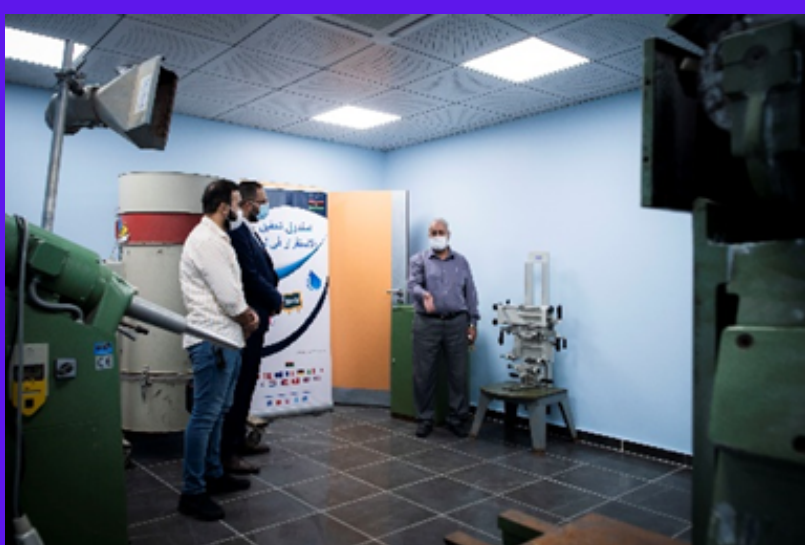
Handover of Prosthetics Unit at Abu Salim Hospital, 16 September 2021

As of 30 September 2021, under SFL Output 1, there were a total of 157 projects in Tripoli, including 154 completed, two ongoing, and one in development. Despite being the only medical facility for amputees in the western and southern regions of Libya, the Prosthetics Unit at Abu Salim Hospital ceased its operation in 2012. Following complete renovation thanks to SFL support, the facility resumed operation and is able to provide medical care to over 1,500 patients per year.