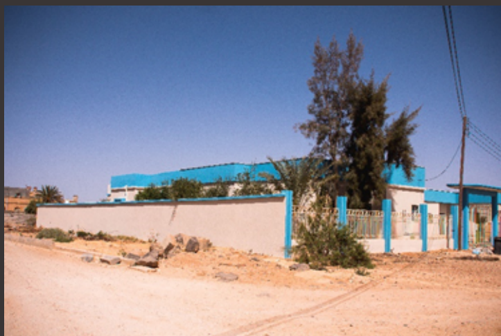
The isolation facility at Bani Walid General Hospital following renovation

As of 30 September 2021, under SFL Output 1, there were a total of 29 projects in Bani Walid, including 25 completed, one ongoing, and three in development. s to SFL support, the diabetes healthcare facility at the Bani Walid General Hospital has been renovated and fully equipped to serve as an isolation center for patients infected with COVID-19.