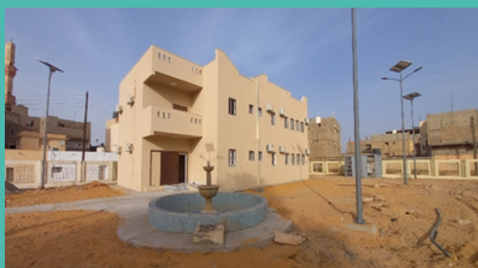
The newly built UNESCO Library in Sebha

As of 30 September 2021, under SFL Output 1, there were a total of 30 projects in Sebha, including 24 completed, two underway, and four in development.