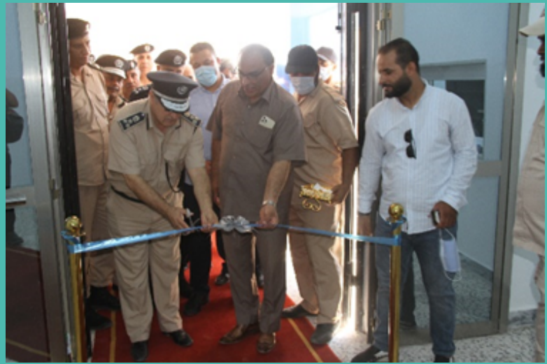
Handover ceremony of the coast guard building in Sirt, 14 September 2021

As of 30 September 2021, under SFL Output 1, there were a total of 45 projects in Sirte, including 27 completed, one ongoing, and 17 in development. The coast guard building in Sirt is a regional body which serves a 150 km stretch of coast. Given its last maintenance in 2004 and withstanding of two wars, the facilities were in dire need of renovation in order to continue its operation. Thanks to SFL, the building has been renovated and provides better working conditions to more than 30 staff. The renovation took place during 2021 Q2 and handed over on 14 September 2021.