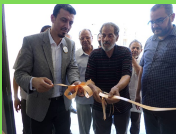
Handover of Omar Al-Mukhtar School following renovation, 14 July 2021

As of 30 September 2021, under SFL Output 1, there was a total of eight projects in Derna, including six completed, one underway, and one in development. As a result of major damage during the conflict, the renovation of one of the educational institutions, the Omar Al-Mukhtar School, was a priority. Following renovation thanks to SFL support, the school is now able to continue to provide quality education to students in better conditions. The handover ceremony took place on 14 July 2021.