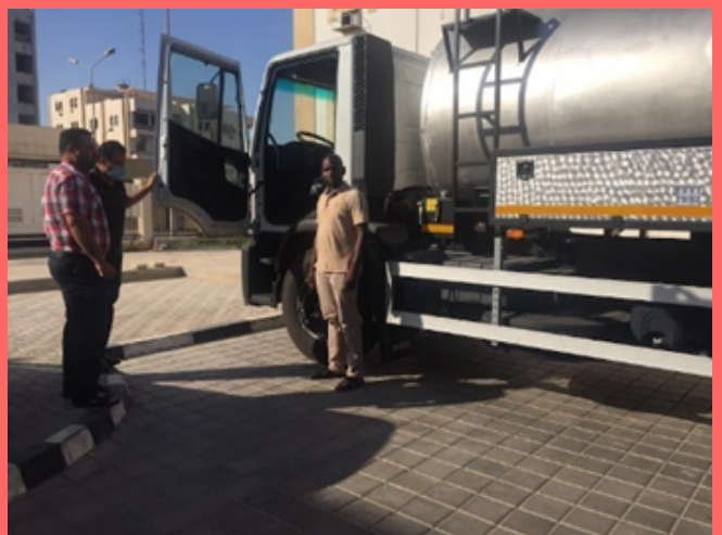
Handover of a high pressure sewer cleaner in Misrata, 6 September 2021

As of 30 September 2021, under SFL Output 1, there was a total of 17 projects in Tawergha, including 10 completed, five underway, and two in development. The municipality of Misrata is facing multiple challenges as a result of rainwater drainage malfunction caused by a deteriorated sewage network. Sewer lines are frequently clogged due to dirt deposits and are not properly cleaned. The issue is most severe in downtown area, especially along streets leading to schools and medical facilities. A new high pressure sewer cleaner provided by the SFL will enable the local water and wastewater company improve its performance and keep the city clean.