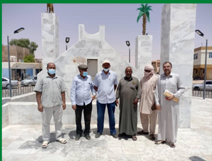
Handover ceremony of the roundabout, 29 August 2021.

As of 30 September 2021, under SFL Output 1, there were a total of 23 projects in Ubari, including 20 completed, two underway, and one in development. The renovation of the roundabout at the main entrance to the city, completed during 2021 Q2, was handed over on 29 August 2021 Q3. The works are part of the general support to the municipality.