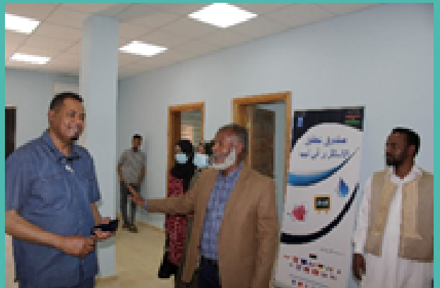
Handover of Tadamon Clinic

As of 30 June 2021, under SFL Output 1, there were a total of 30 projects in Sebha, including 23 completed, three underway, and four in development.