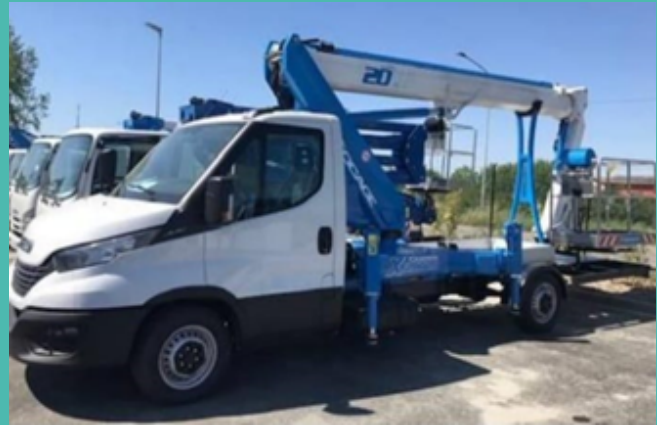
One man truck mounted lifting basket crane delivered to Kufra Municipality.

As of 30 June 2021, under SFL Output 1, there was a total of 9 projects in Kufra, including two completed, two underway, and five in development.