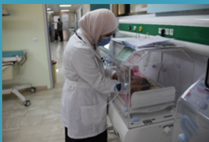
A nurse is checking on a newborn baby at Benghazi Children’s Hospital

As of 30 June 2021, under SFL Output 1, there was a total of 40 projects in Benghazi, including 38 completed, one underway, and one in development. A nurse is checking on a newborn baby at Benghazi Children’s Hospital.