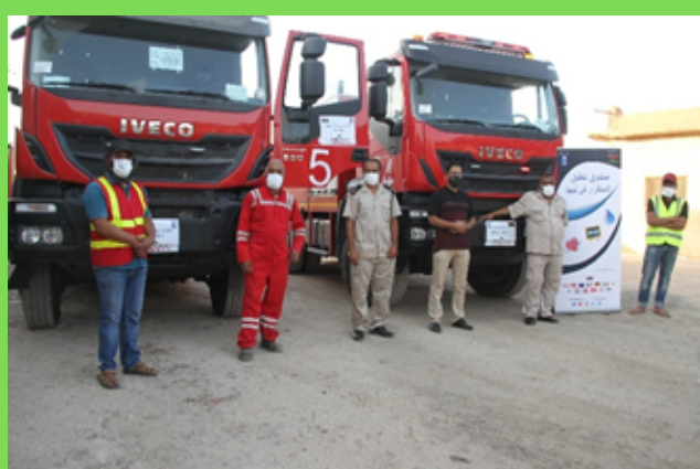
Handover of two firefighting trucks

As of 30 June 2021, under SFL Output 1, there was a total of 8 projects in Derna, including five completed, one underway, and two in development.