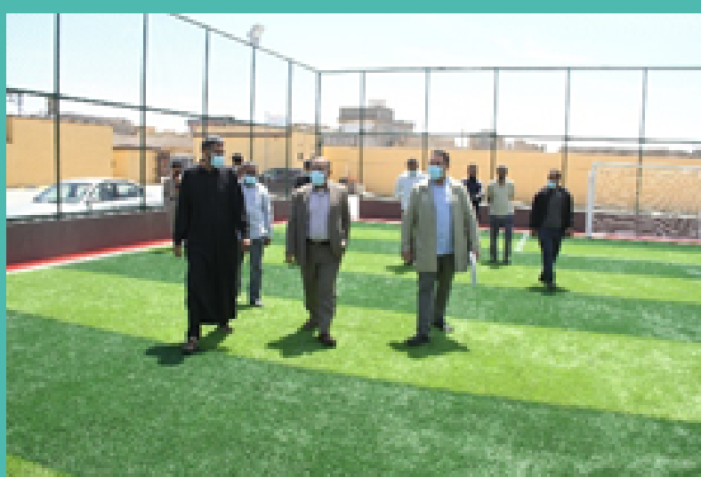
Handover of Talae Al Naser School

As of 30 June 2021, under SFL Output 1, there were a total of 43 projects in Sirt, including 25 completed, one ongoing, and 17 in development. Handover of Talea Al Nasr School in Sirte, April 2021.