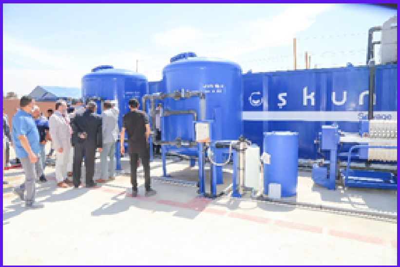
Handover of the sewage treatment plant

As of 30 June 2021, under SFL Output 1, there were a total of 157 projects in Tripoli, including 150 completed, six ongoing, and one in development.