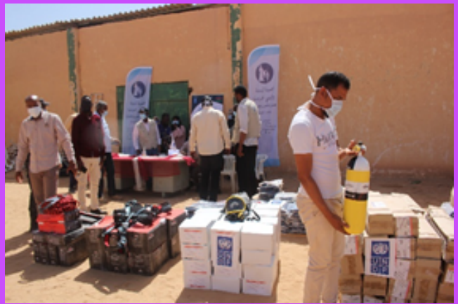
Handover of PPE equipment

As of 30 June 2021, under SFL Output 1, there was a total of 15 projects in Ghat, including 12 completed, and three in development. Hit by severe flooding in June 2019, the municipality of Ghat was not prepared nor well equipped to combat the situation. The water and sewage systems were affected and required frequent interventions. With support from UNDP Stabilization Facility for Libya, the local Water and Wastewater Company received the necessary equipment such as water suction pumps, generators, and sewage pumps, among others, as well as personal protective equipment (PPE) such as masks, gloves, workwear and safety harness as part of COVID-19 response.