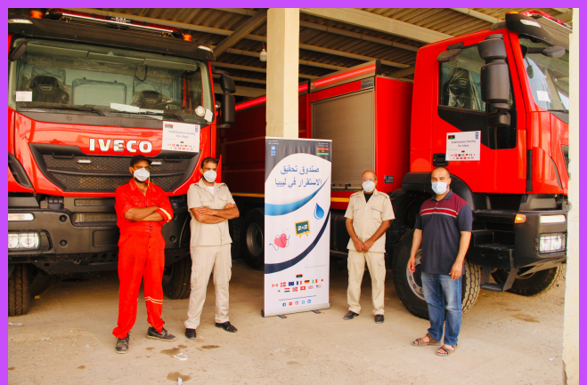
Handover of two firefighting trucks

During 2021 Q2, SFL completed two projects in Ajdabiya. UNDP Stabilization Facility for Libya provided two new firefighting trucks to the municipality of Ajdabiya, replacing four old vehicles which required regular maintenance and were insufficient to cover the needs of the city. The vehicles will also allow the local authorities to cover neighboring municipalities in the Al Wahat area, where similar equipment is lacking, serving more than 300,000 residents.