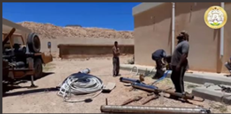
Installation of well pumps in Bani Walid.

As of 30 June 2021, under SFL Output 1, there were a total of 29 projects in Bani Walid, including 24 completed, two ongoing, and three in development.