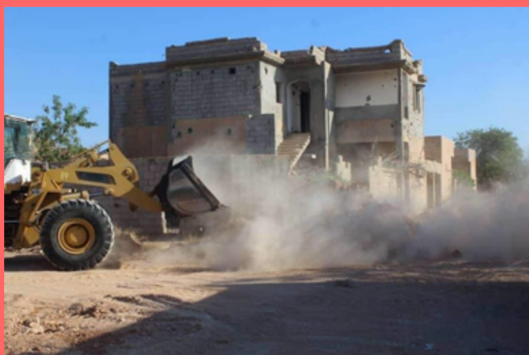
Ongoing campaign to remove rubble in Tawergha

As of 30 June 2021, under SFL Output 1, there was a total of 17 projects in Tawergha, including six completed, nine underway, and two in development.