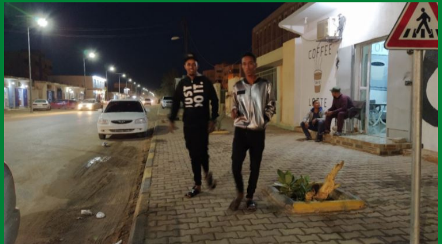
Businesses can work until late night after installation of solar streetlights.

As of 31 December 2020, the SFL had a total of 23 projects including 18 completed, four underway and two in development.