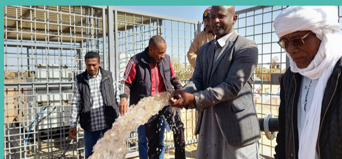
Handover of the Western well in Godwah

As of 31 December 2020, the SFL had a total of 30 projects including 18 completed, eight underway and four in development. Godwah is a small village located about 70 km south of Sebha. This village has been attacked by ISIS over the past year, causing the displacement of a number of its residents. Furthermore, it was suffering from a lack of potable water.