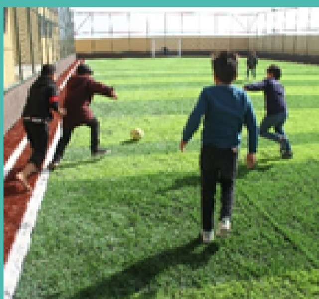
Students are playing football at the newly renovated Salim Alshorfi School in Sirt

As of 31 December 2020, the SFL had a total of 42 projects including 23 already completed, two ongoing and 17 still in development.