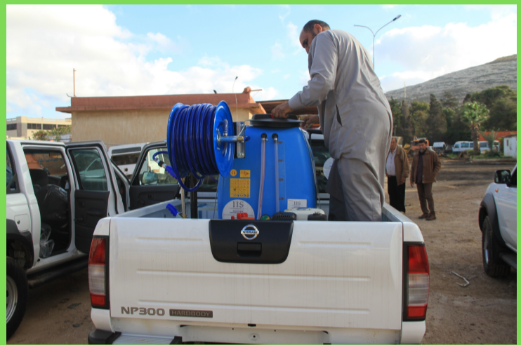
Handover of three pesticide sprayer vehicles

As of 31 December 2020, the SFL had eight projects in Derna including two already completed, four underway and two in development.