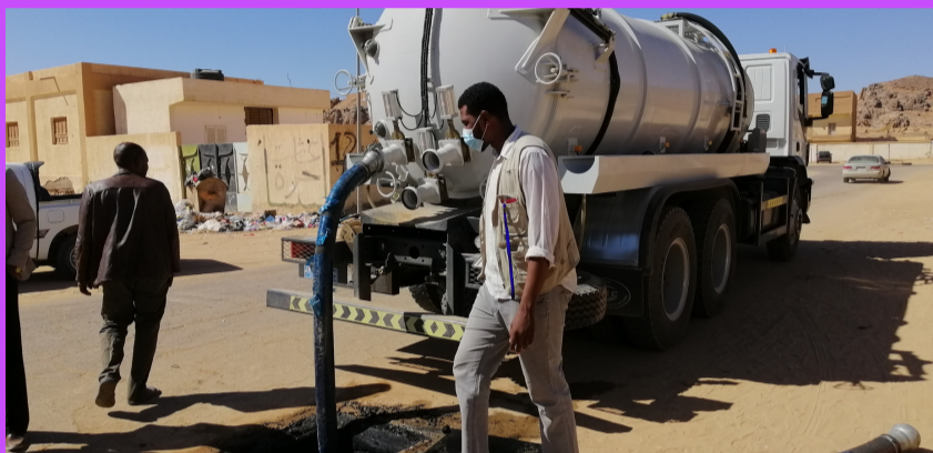
A sewage suction truck in action in Ghat

As of 31 December 2020, the SFL had a total of 15 projects including ten already completed, two ongoing and three in development.