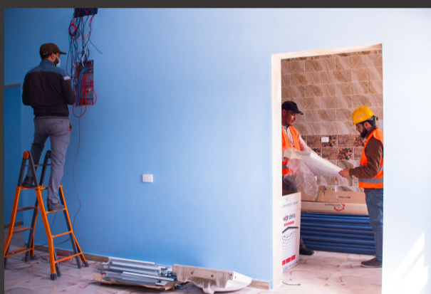
Ongoing work to renovate the Diabetes Facility at Bani Walid Hospital

As of 31 December 2020, the SFL had a total of 28 projects including 23 already completed, one ongoing and four in development. Renovation of the Diabetics Clinic at the Bani Walid Hospital will enable the medical institution to have an isolation facility for COVID-19 patients with a capacity of 20 beds.