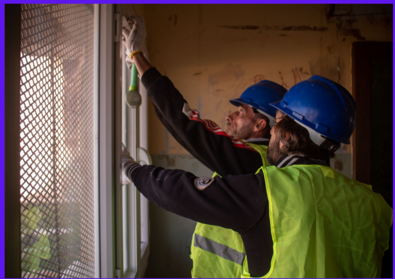
Ongoing work to renovate Al Hakh Revolution School

As of 31 December 2020, the SFL had a total of 157 projects including 144 already completed, ten ongoing and three in development. Al Hakh Revolution School, Abdulbasit Al Hamroni School and Al Jelani Al Gargoti School were under renovation in Qasr Ben Gashir Municipality, Greater Tripoli. They were severely damaged during the conflict in Tripoli. After rehabilitation, around 1190 students will attend classes in better condition.