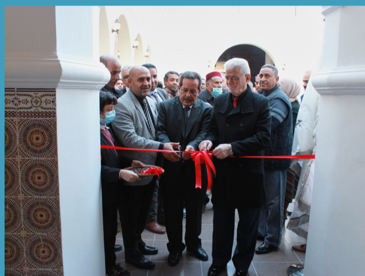
Inauguration of Al-Kikhia Cultural House after renovation on 16 December 2020

As of 31 December 2020, there were 40 projects in Benghazi including 35 completed, four underway and one in development. Al-Kikhia Cultural House was completed and handed over in this period. Before the conflict, it accommodated the main office for the Historical City Authority which had 75 staffs. The House was famous for being a hub for all kinds of cultural events in the city. Due to its location, in Benghazi downtown, the infrastructure was severely affected by the armed conflict and it was looted several times. After rehabilitation, the House is ready to play its role again and gives an opportunity to residents to rebuild their community, social cohesion and the rich cultural life in the city.