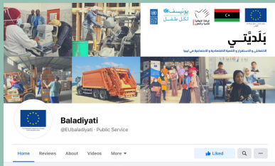
Baladiyati Facebook Page

With the aim of providing visibility to the project and the European Union as supporter of it for a diverse range of groups within Libya and the international community, UNDP Libya Communication Unit is following a plan which contains activities to raise awareness about the project, its purpose, activities, achievements, partners and beneficiaries.