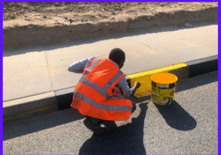
Ongoing work to renovate the second ring road in Tripoli, November 2021