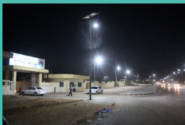
A section of the main road from Sebha airport to downtown lit with the new streetlighting system

As of 31 December 2021, under SFL Output 1, there was a total of 30 projects in Sebha, including 25 completed, one underway, and four in development.