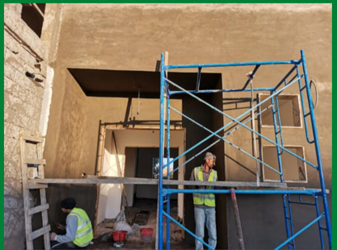
Ongoing work to build the National Legal Training center in Ubari, December 2021.

As of 31 December 2021, under SFL Output 1, there was a total of 23 projects in Ubari, including 20 completed, two underway, and one in development. The National Legal Training Center will be an extension of the Faculty of Law at Ubari University. It will accommodate more than 400 students, including 280 women, out of 920 students currently enrolled at the Faculty of Law from Ubari and neighboring municipalities such as Ghat, Al-Ghourifa, and Bent-Baya.