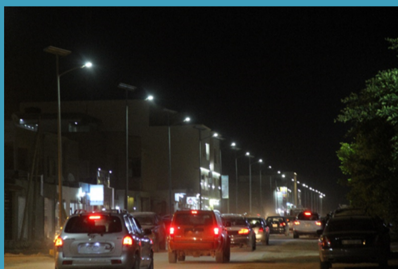
One of the previously unlit streets in Benghazi.

As of 31 December 2021, under SFL Output 1, there was a total of 40 completed projects in Benghazi.