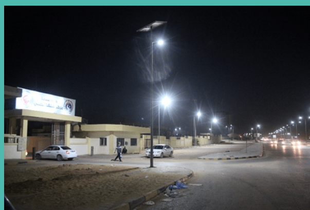
A section of the main road from Sebha airport to downtown lit with the new streetlighting system

As of 31 March 2022, under SFL Output 1, there was a total of 30 projects in Sebha, including 25 completed, two are underway, and three in development.