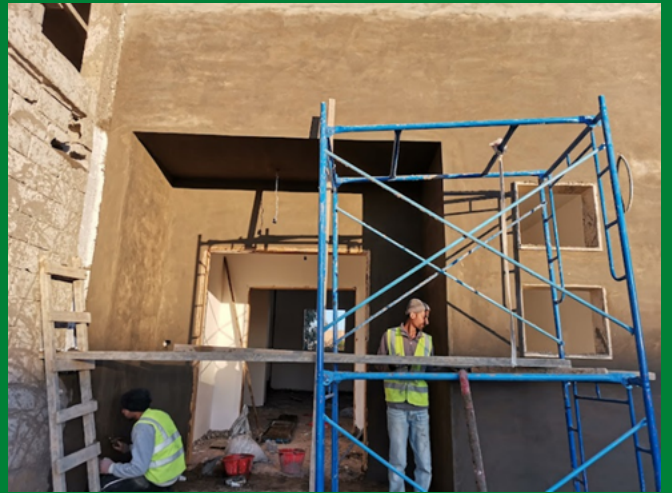
Ongoing work to build the National Legal Training center in Ubari, December 2021.

As of 31 March 2022, under SFL Output 1, there was a total of 23 projects in Ubari, including 21 completed, one underway, and one in development. The National Legal Training Center will be an extension of the Faculty of Law at Ubari University. It will accommodate more than 400 students, including 280 women, out of 920 students currently enrolled at the Faculty of Law from Ubari and neighboring municipalities such as Ghat, Al-Ghourifa, and Bent-Baya.