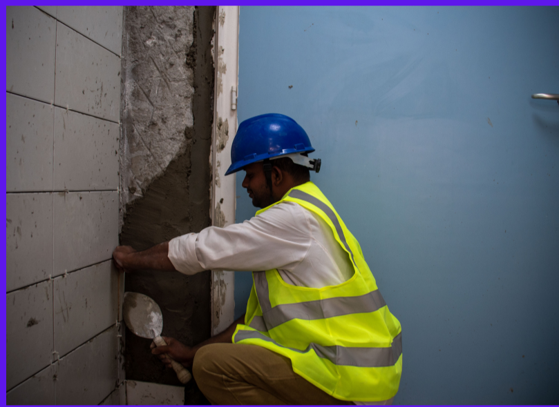
Ongoing work to renovate Ali Asker Hospital

By the end of third quarter of 2020, SFL has already completed renovation of 66 schools. It also supplied equipment consisting of eight refuse collector semi-trailers and two tractor heads to Hay Al-Andalus and Ben Gashir municipalities. More than 375,000 inhabitants of these municipalities will benefit from improved services as far as garbage collection is concerned.