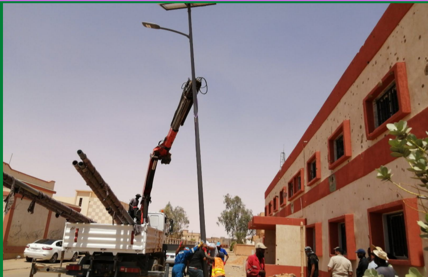
Ongoing work to install solar street lights

By the end of third quarter of 2020, the SFL had completed renovation of the library and the cafeteria at Ubari University and the Youth Social Center, and was preparing to hand them over to the end users. The educational institution hosts 3,000 students from Ubari and neighbouring cities. Installation of a 11 km solar street light system was ongoing during the monitored period.