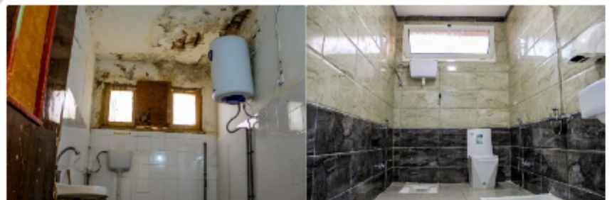
A rehabilitated bathroom in Atia Al Kaseh Hospital, Kufra.

The full renovated Atia Kaseh General Hospital in Kufra, the largest and oldest medical center in the South-East region, serves more than 80,000 people in Kufra and neighbouring cities such as Tazirbu and Rabiana – very remote area (2000km from Tripoli and about 990km from Benghazi). The medical center was damaged by the various conflicts that the city witnessed in the recent years.