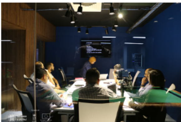
TEC Incubator

In April 2019, TEC held its first training course in Sebha, providing intensive business training targeting entrepreneurs to equip them with the business skills and needed to launch their start-ups. The training took place over the period of two weeks starting from April 13th until April 25th. 102 applications were received for TEC Crash in Sebha, out of which only 20 entrepreneurs were selected for the training.