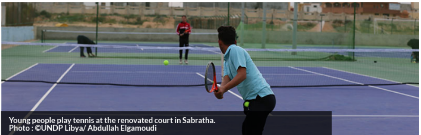
Young people play tennis at the renovated court in Sabratha.