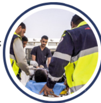
Saving lives faster in Kufra.

$14 Million (92.3% from advanced resources)