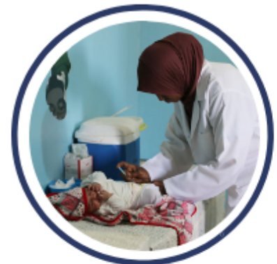
A nurse is vaccinating a new born at Golden Clinic in Sebha.